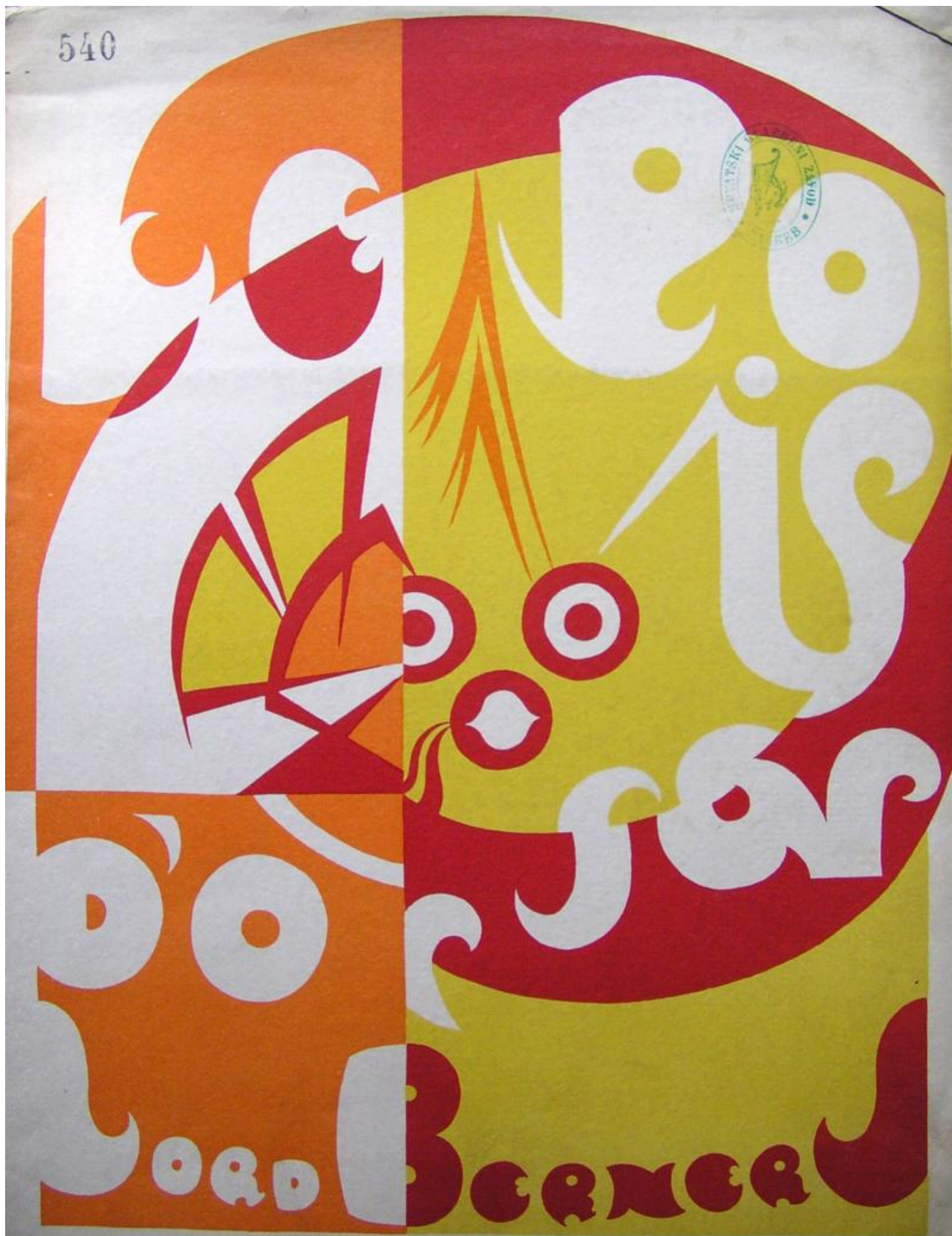
Figure 4: cover of Le poisson d'or by Lord Berners, illustrated by Natal'ya Gončarova, 1919