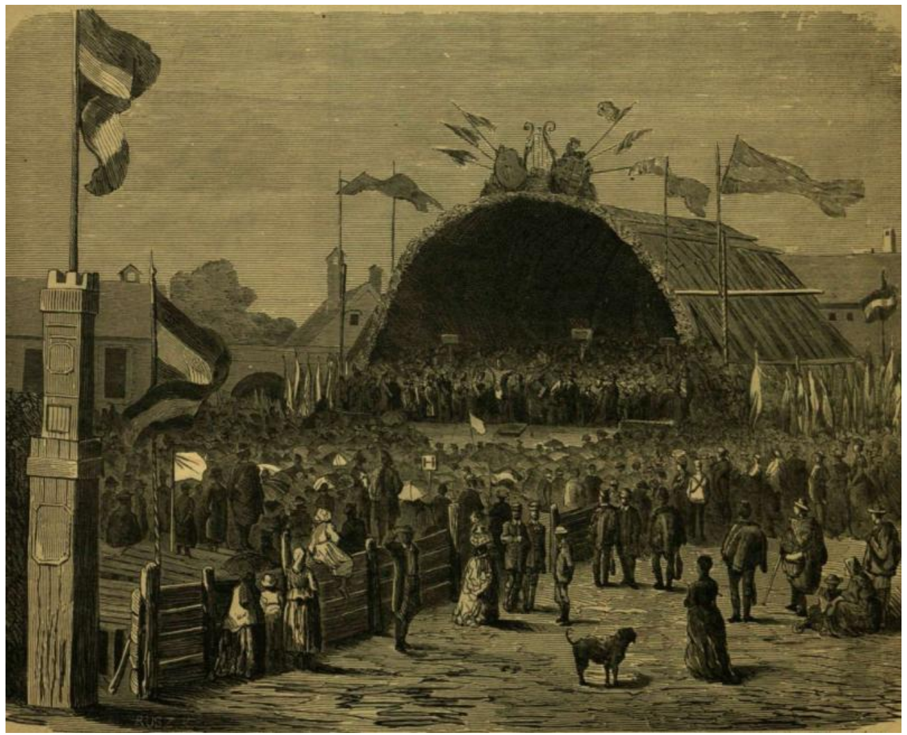
Figure 4: The 1868 national gathering in Debrecen; the societies decided here that in the future the national gatherings would have to be organized by the National Choral Society (picture by Mihály Munkácsy, published in Vasárnapi Újság , August 14, 1892); by courtesy of National Széchényi Library, Budapest, Digital Image Archive