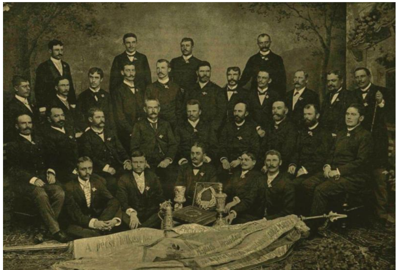
Figure 1: The dalárda in Pécs on the occasion of its thirtieth anniversary, 1891