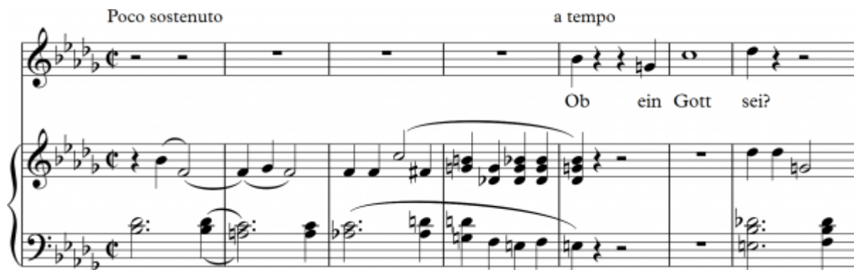
Example 1: L. v. Beethoven, “An die Hoffnung,” Op. 94, mm. 1-7; Your browser does not support the audio element.