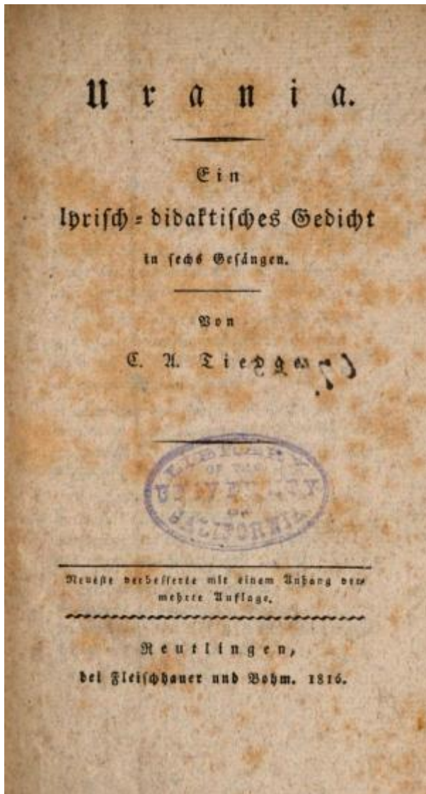
Figure 3: Carl August Tiedge, Urania: Über Gott, Unsterblichkeit, und Freiheit (Urania: On God, Immortality, and Freedom), Reutlingen: Fleischhauer and Bohm, 1816.

These weighty moral questions are given voice in Ali Smith's Spring as, for instance, when the invisible is made visible with the specter of God being conjured up in a chilling collage of racist social media vitriol, the kind targeted at immigrants on a regular basis that remains otherwise unseen by the population at large: