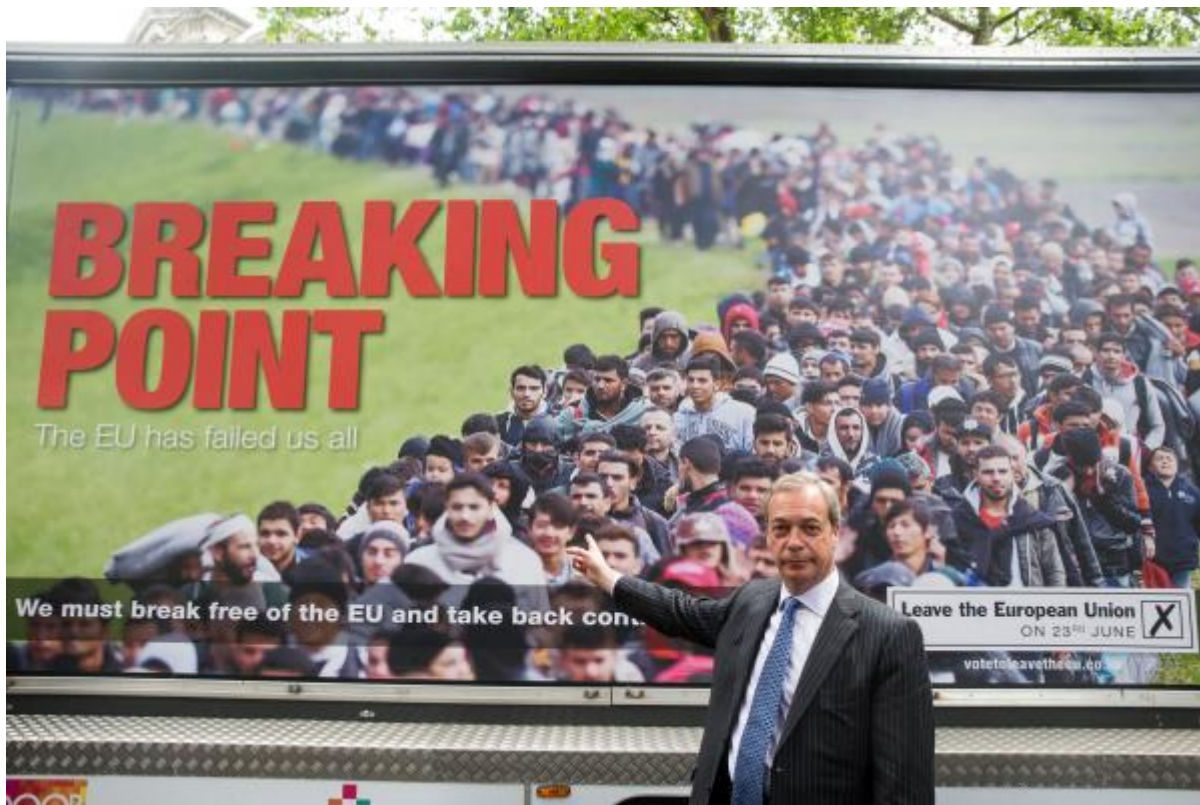
Figure 2: Nigel Farage unveils and discusses UKIP’s new poster “Breaking Point” highlighting concerns about immigration before the Brexit vote in June 2016.

The language of “swarms” of “migrants” that Nigel Farage adopted in his Brexit canvassing in July 2015 came just two months before the shocking images of the three-year-old Syrian boy Alan Kurdi washed up on a beach near the Turkish resort of Bodrum. [24] Nigel Farage’s 2016 “Breaking Point: The EU has failed us all” campaign echoed, if not emulated, Theresa May’s van strategy.