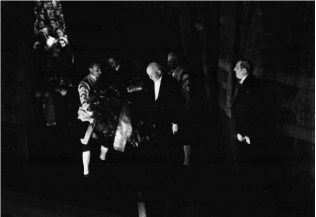
Figure 1: festive staging of Friedenstag at Vienna State Opera as part of the Reichstheaterfestwochen (Reich Theater Festival) in Vienna, June 10, 1939; presentation of a laurel wreath to Richard Strauss, with director Clemens Krauss on the right-hand side