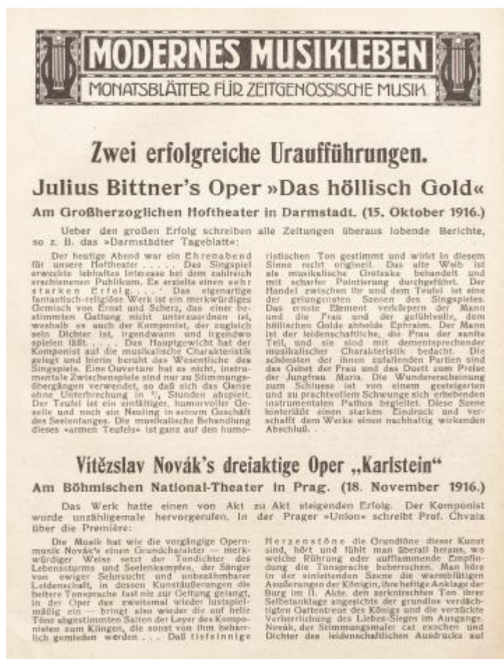
Figure 5: Musikpädagogische Zeitschrift (Modernes Musikleben), 6, no. 11-12 (November-December 1916): 93

Further new publications and concerts could be announced under the vague heading “Notices,” as well as personal news and reports from the composers’ “workshop”: