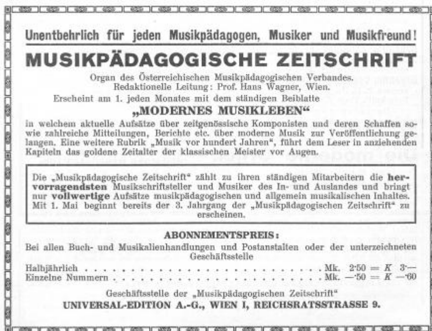
Figure 4: Ad for the Musikpädagogische Zeitschrift with its supplement Modernes Musikleben , in Musica Divina 1, no. 1 (May 1913): 35

A preamble to the first “supplement” stated that it was “desirable and advantageous” for every music educator to receive “information about the life and work of modern composers and performers.” The intended circle of readers, however, went beyond music educators: it was addressed “to all who have a sense of and interest in the progress which, just as in all other fields of art, is also making itself vividly felt in music today.” [27] This “magazine within a magazine” also contained longer and shorter contributions, book and sheet music reviews, notices, and concert reports, with additional advertisements concluding the publication. [28]