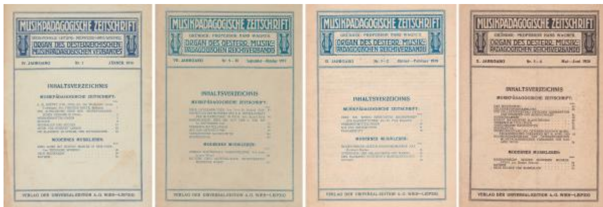
Figure 2: Covers of the Musikpädagogische Zeitschrift

At first glance, the issues of the Musikpädagogische Zeitschrift follow the conventional structure of a music journal, with the additional features of an association newsletter. [20] Integral parts of the journals are essays mainly on music educational topics, which are often printed in installments. The sections already established in the first volume, such as “Verbands-Mitteilungen” (association news), “Bücher und Musikalien” (books and sheet music), and “Notizen” (Notices), were retained. Since the majority of the readership worked in music pedagogical professions, [21] the journal naturally dealt primarily with their everyday work and working conditions. The association fought for a better status for both private and employed music teachers, in terms of their remuneration, their social security, and an upgrading of their training, and was not afraid to name names when pointing out abuses. The sections “Verbands-Mitteilungen” and “Notizen” contain detailed reports of meetings, but also announcements of concerts and other activities of members of the association, in addition to personal information such as professional anniversaries or marriages, reports from the local groups, and job offers. [22] The section “Bücher und Musikalien” presents new publications, with a focus on teaching literature. The end of the editorial section, which is additionally marked with the words “End of editorial section” at the bottom of the page, [23] is followed by a series of advertisements.