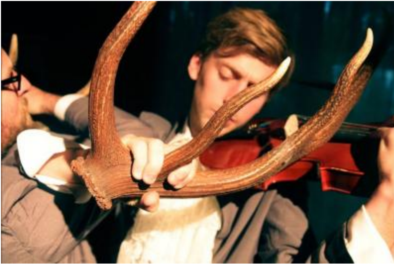
Christa Brüstle, “Atlas der gesamten Musik und aller angrenzenden Gebiete”: Austrian Stereotypes, Music, and Material Agency as a Relational Model in Georg Nussbaumer’s Concert Installations

concert installations. She focuses both on the texture of the material used and on the way it is dealt with compositionally. In order to take into account the cultural-historical weight of the materials, the author refers to the concept of agency, thus bringing to light the relation between significant materials, the composer, and the audience.