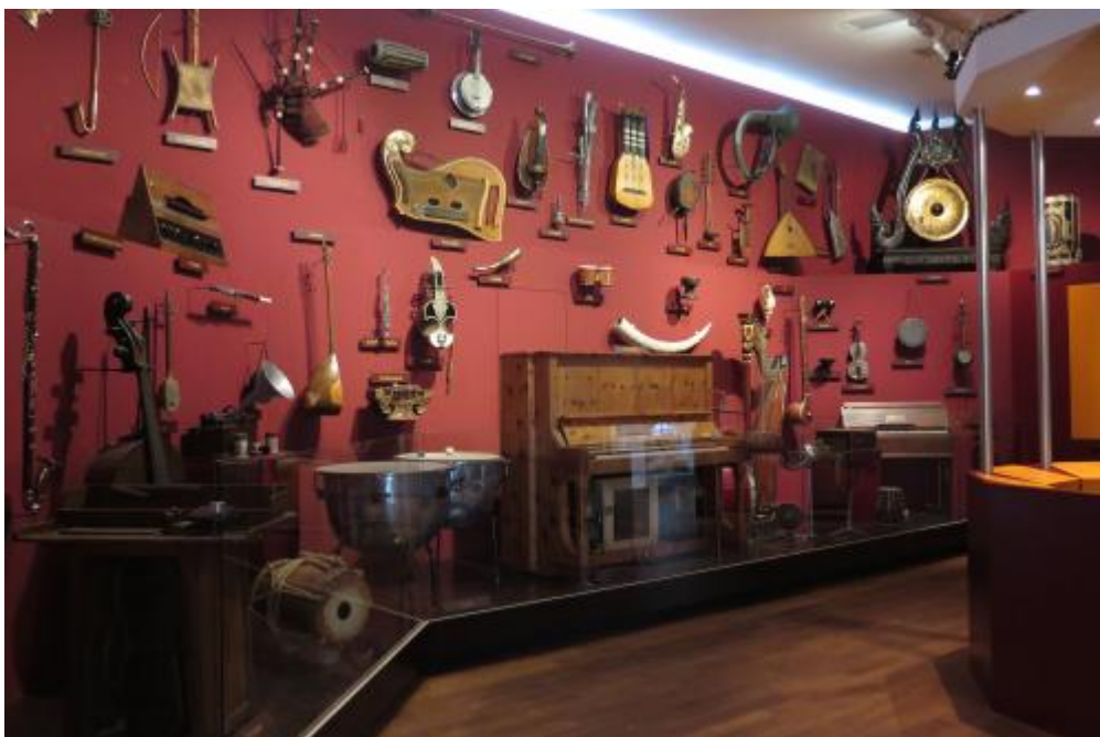
Figure 3: Interactive Soundlab station “Wunderkabinett” in the Music Collection at the Munich City Museum

sound impressions of some of the instruments on display can be selected via a button at the interactive Soundlab station “Wunderkabinett.” [37] In contrast to the use of headphones, which allow for individual listening, the music can be heard by all those present in the room. As I was able to observe, the transmission over loudspeakers meant that some visitors became aware of the station as soon as they entered the exhibition. Visitors in smaller groups tried out the station together; I was also able to observe that the stations were an occasion for conversations among visitors who did not know each other before visiting the museum. In addition, loudspeakers deliver the audio segments to visitors as a group, allowing significantly more communication than at exhibitions with portable devices with headphones. Furthermore, the type of content (music/text) of the portable device has to be taken into account. I observed that in Brussels—compared to Paris or Munich—there was considerably more verbal communication between visitors while using headphones. This could be due to the fact that the audio guide in Brussels offered only music recordings (and written text on the display, but no audio text), whereas the audio guides in Paris and Munich included spoken text.