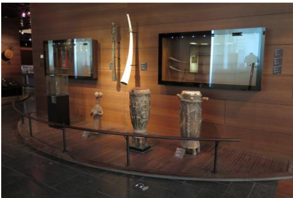
Figure 1: Showcase at the Musical Instruments Museum (MIM) in Brussels: On the floor in front of the showcase, a loudspeaker symbol is indicating the spot where visitors should position themselves for the audio segment to start automatically on their portable device; photo: Elisabeth Magesacher