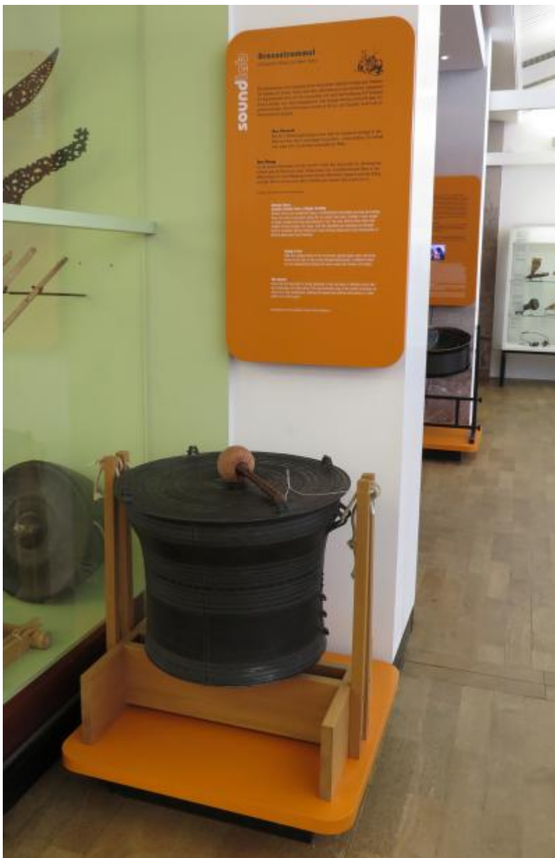
Figure 4: Interactive station “Bronze Kettledrum” in the Music Collection at the Munich City Museum

through a series of “Soundlab stations.” These interactive stations enable visitors to get to know “sound phenomena.” At each station, visitors find a description of the phenomenon as well as short texts including precise instructions for carrying out a sound experiment. The stations are distributed across the exhibition rooms and correspond to the respective room theme. At the “Bronze Kettledrum” station, for example, visitors can play a hpa-si, a bronze kettledrum from Myanmar. A text indicates that there are differences in sound depending on whether the drumhead is struck at the center or near the rim of the drum. The location of the station within the exhibition area enables visitors to establish connections with the instruments on display (behind glass). A visually very similar drum is located in the showcase not far from the Soundlab station. Due to the spatial proximity, it is easy to make the connection with the exhibited instrument. With regard to the use of the Soundlab stations, I was able to observe that small groups of visitors in particular tried out the stations together and had a lot of fun, which should not be underestimated as a motivation for visiting the exhibition.