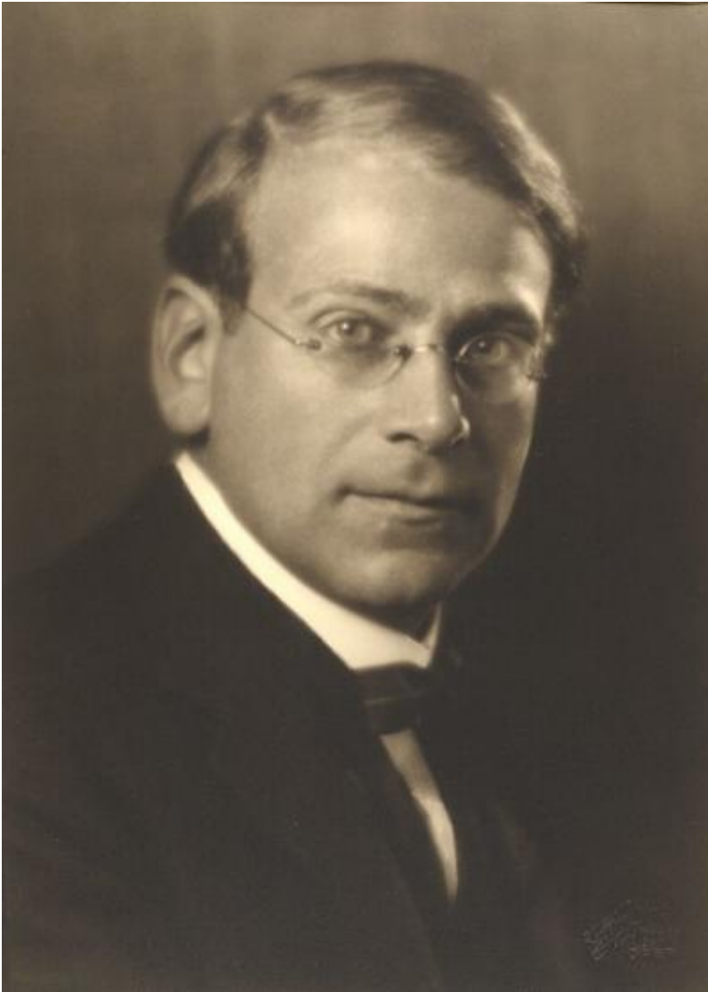
Figure 1: Egon Wellesz in 1927