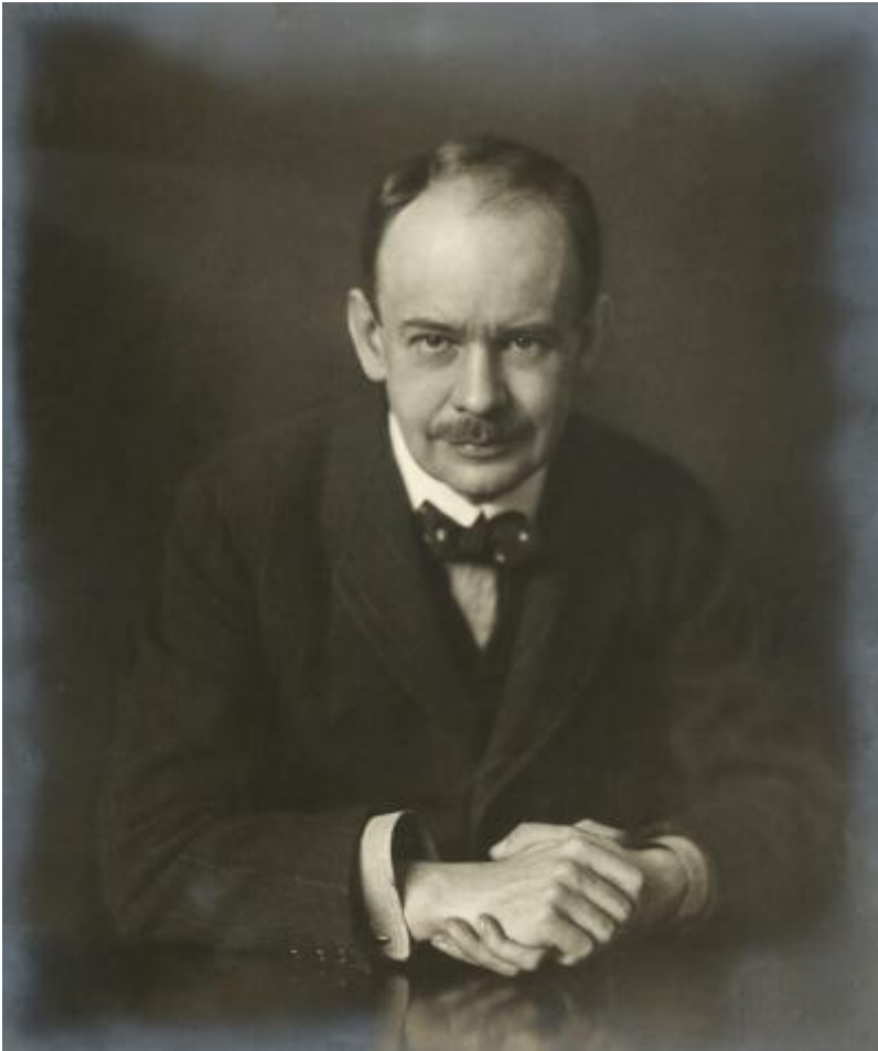
Figure 3: Max Dvořák

Dvořák, who like Franz Wickhoff and Riegl was considered particularly open-minded and progressive, followed in Riegl's footsteps and also addressed Baroque art in detail, which he did not regard as an inferior or transitory phenomenon but rather placed on an equal footing with the Renaissance and Classicism in a historic line that would ultimately lead to contemporary art. Incidentally, this met with much more sympathy at the Vienna Department of Art History than at other universities in German-speaking academia. [30] Dvořák's very popular lectures [31] made a great impression on Wellesz, who mentioned in particular that the lectures on Baroque art had inspired his own research on Cavalli, who constituted the topic of his habilitation thesis in 1913: