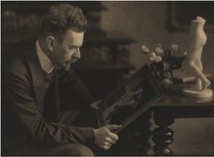
Figure 4: Heinrich Wölfflin

In today's understanding, the musical Baroque began around the year 1600, that is, roughly with the emergence of the opera and the oratorio in Italy, and ended around Bach's death in 1750. In the 1920s and 1930s, however, various boundaries were still being discussed among musicologists like Wellesz, but also, for example, by Haas and Schenk, who argued against shifting the beginning to before the year 1600. Schenk regarded the period between 1600 and 1750 as an independent Baroque style, which he defined as an "expressive style of harmonic surface, in contrast to the imitative figural style of the Renaissance" ("expressive Stil harmonischer Fläche, im Gegensatz zum imitativen Figuralstil der Renaissance"), and called for ignoring art-historical ways of thinking in characterizing Baroque music. [46] Haas also argued that the Baroque era began around 1600 due to the deep caesura that both Palestrina and Lasso had left behind after their deaths in 1594. [47] He also criticized Wustmann and particularly Wellesz, who shifted the boundary further on the basis of his "art-historical reassessment of the Baroque style" ("kunstgeschichtliche Neuwertung des Barockstils"). [48]