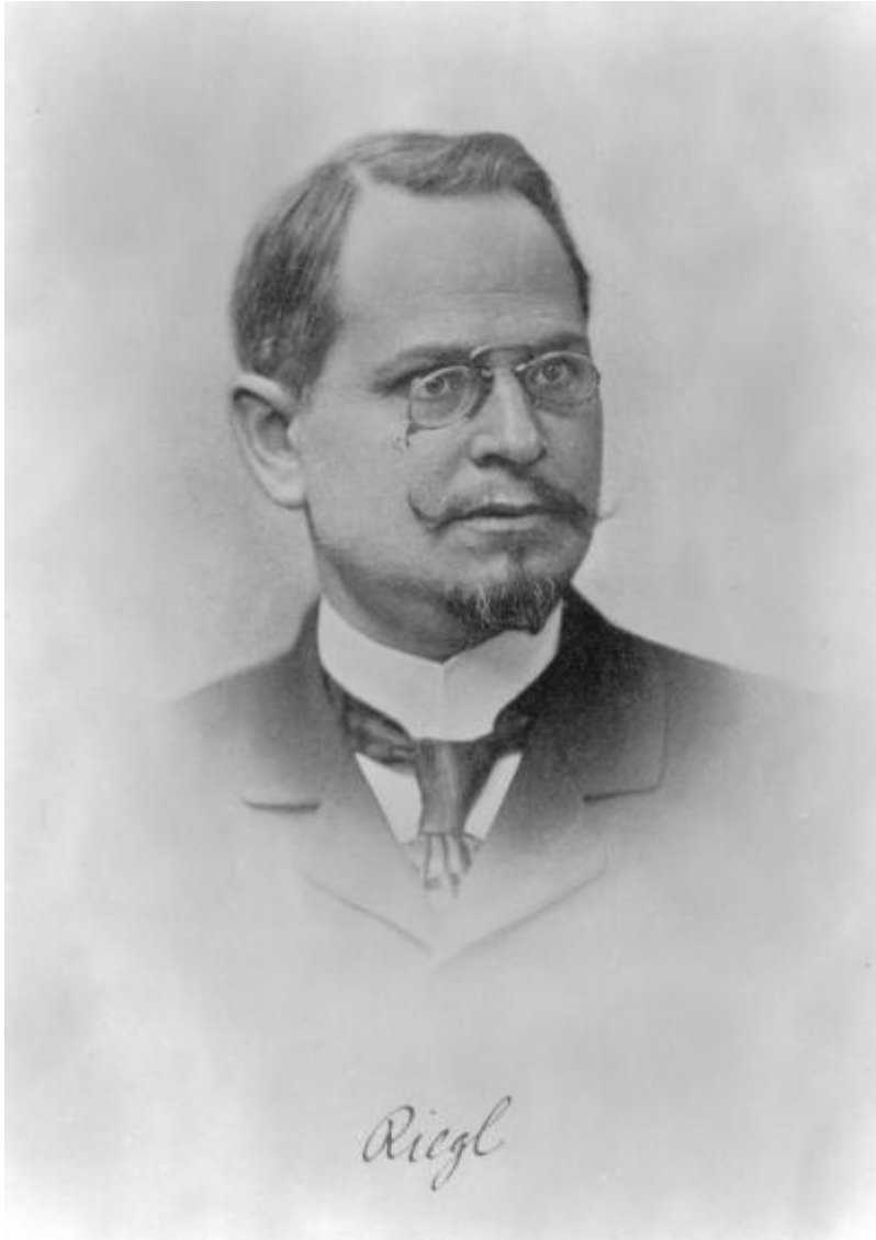
Figure 2: Alois Riegl

“Renaissance und Barock”), in which he explicitly referred to works by prominent art historians such as Jacob Burckhardt, Heinrich Wölfflin, Cornelius Gurlitt, Alois Riegl, or Max Dvořák. [23]