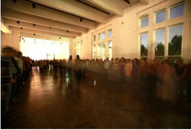
Figure 3: “VARIETIES” at MAK, Vienna