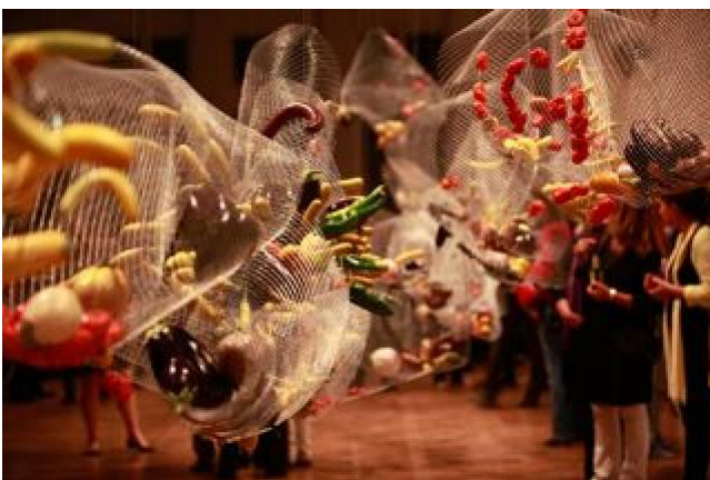
Figure 2: “VARIETIES” at MAK, Vienna

Unusual forms of presentation and communication created by novel technical means have characterised many of Pia Palme’s vocal pieces from the beginning. A relatively early example is “VARIETIES” for mixed choir and two solo voices (mezzo soprano and baritone), composed in 2009. [34] The title alludes to the compositional and performative process of the work: a vast field of sounds is generated from a single sonic source. The composer applies audio scores as a performance concept for a choir of 100 people in a spatial setting. The setting for the performance at the MAK museum Vienna was created by Pia Palme in collaboration with the Gartenbauschule Schönbrunn. The year 2009 was the international year of the aubergine; thus, the scenery for the performance was designed by the spatial Ikebana master Irene Pichlhöfer as an installation made of 700 kg of aubergines comprising 80 old varieties. The libretto is based on texts by Sophie Reyer and Oswald Egger written in coproduction. In order to parallel the idea of propagation from a source which determines the musical process, both authors followed a specific procedure: each verse by Egger was answered by a line by Reyer.