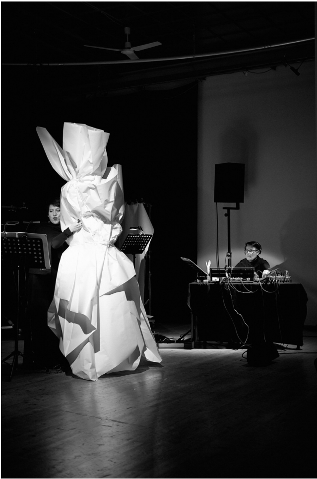
Figure 4: “BUT STILL ATTACHED TO LIFE AT ALL FOUR CORNERS”, December 31, 2013 (premiere) (copyright Markus Gradwohl)

percussion instrument, to be treated with precisely timed movements notated in the score. [...] The live electronic setup is partially controlled by feathers moved over light sensors”. [51]