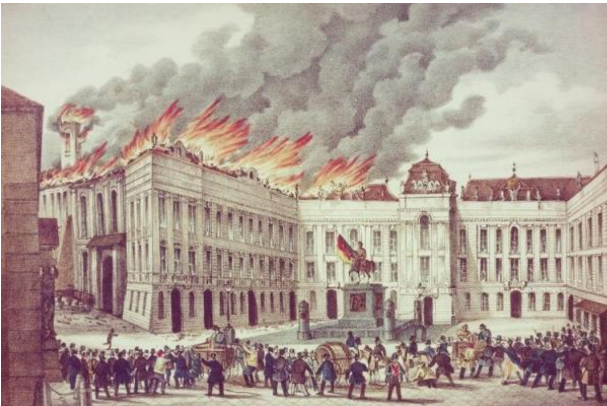
Figure 2: Wiener Oktoberaufstand 1848, Dachbrand der Hofbibliothek und der Augustinerkirche am Josefsplatz, Kolorierte Lithografie, 1848