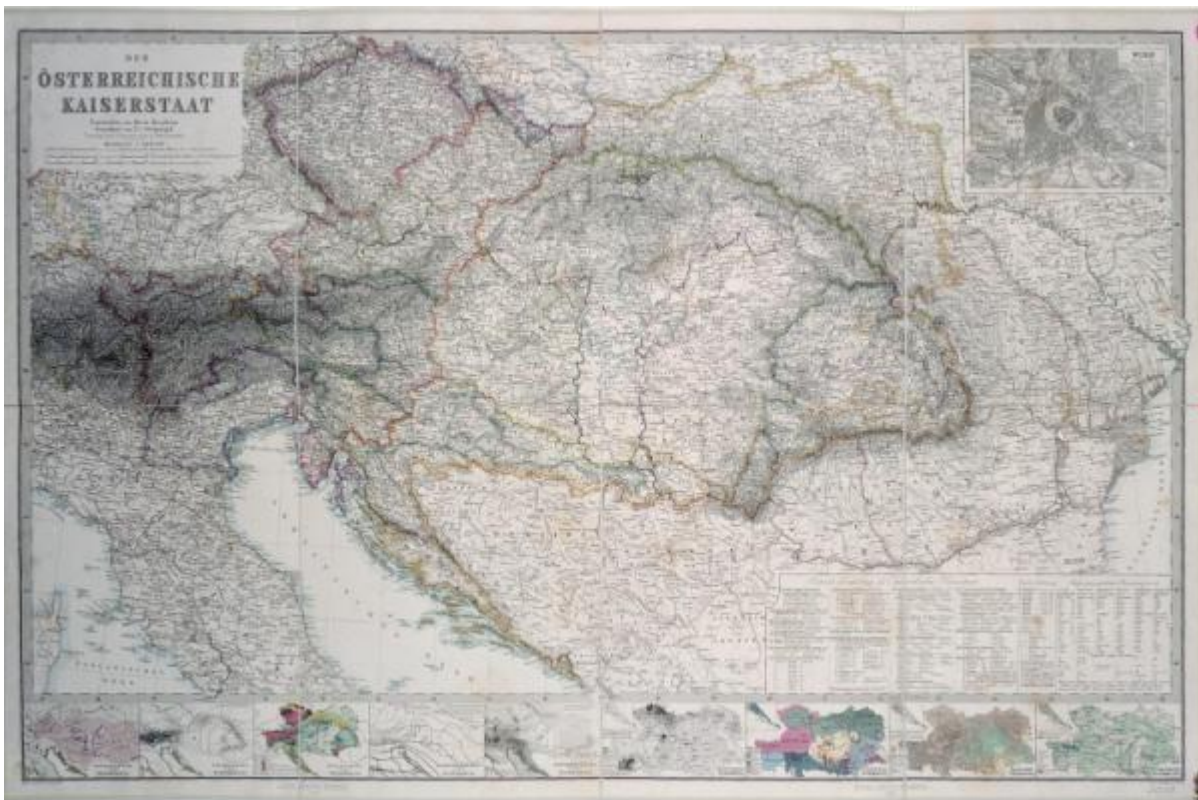
Figure 3: Der Österreichische Kaiserstaat