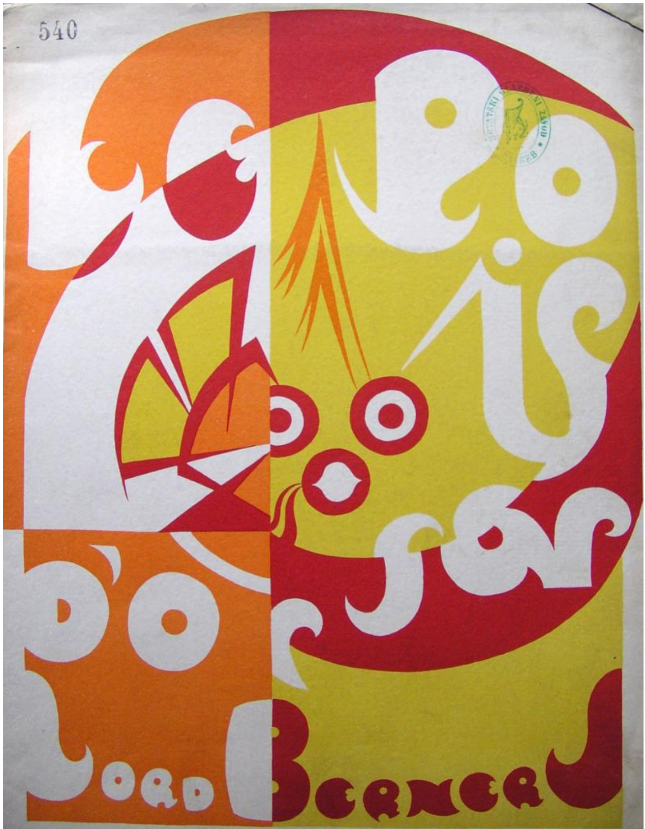
Figure 4: cover of Le poisson d'or by Lord Berners, illustrated by Natal'ya Gončarova, 1919