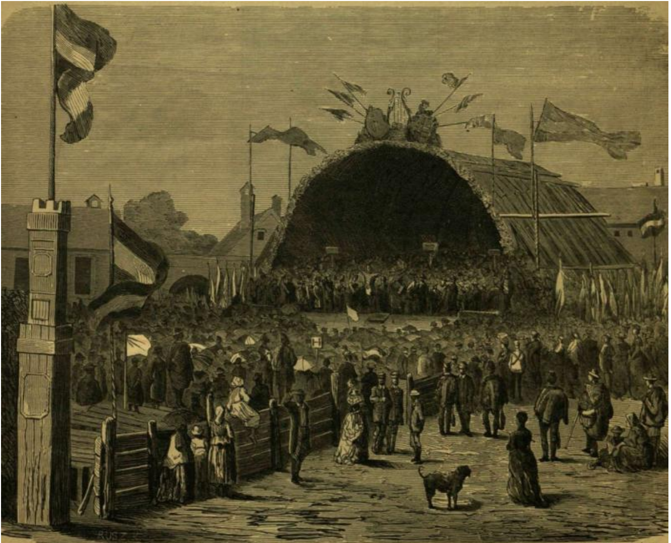
Figure 4: The 1868 national gathering in Debrecen; the societies decided here that in the future the national gatherings would have to be organized by the National Choral Society (picture by Mihály Munkácsy, published in Vasárnapi Újság , August 14, 1892)