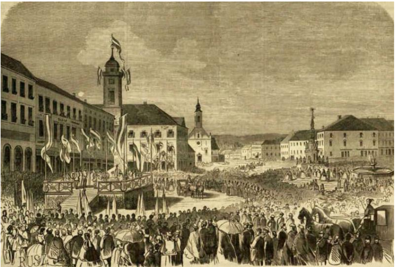
Figure 2: The consecration of the Pécsi Dalárda's flag on August 15, 1864 during the National Choral Gathering (picture by Gusztáv Keleti, published in Vasárnapi Újság , September 4, 1864)

Music schools also helped the work of the choral societies, especially the schools for singing. In Sopron, János Lorenz (n/a-1877) brought new life to the Musikverein at the end of the 1850s and gave the singing-school a new boost. In Pécs, Wachauer opened his singing-school in 1860 and, as a local newspaper reported, encouraged the students to participate in the dalárda . In Debrecen, the students of the zenede (music school) performed together with the reformed college choir and the local choral society, [21] and in Szeged the zenede itself established the choral society. [22] So we can see how music education complemented the choral movement, especially in the way it taught students to sing, created a supply of trained singers, and intentionally collaborated with the movement.