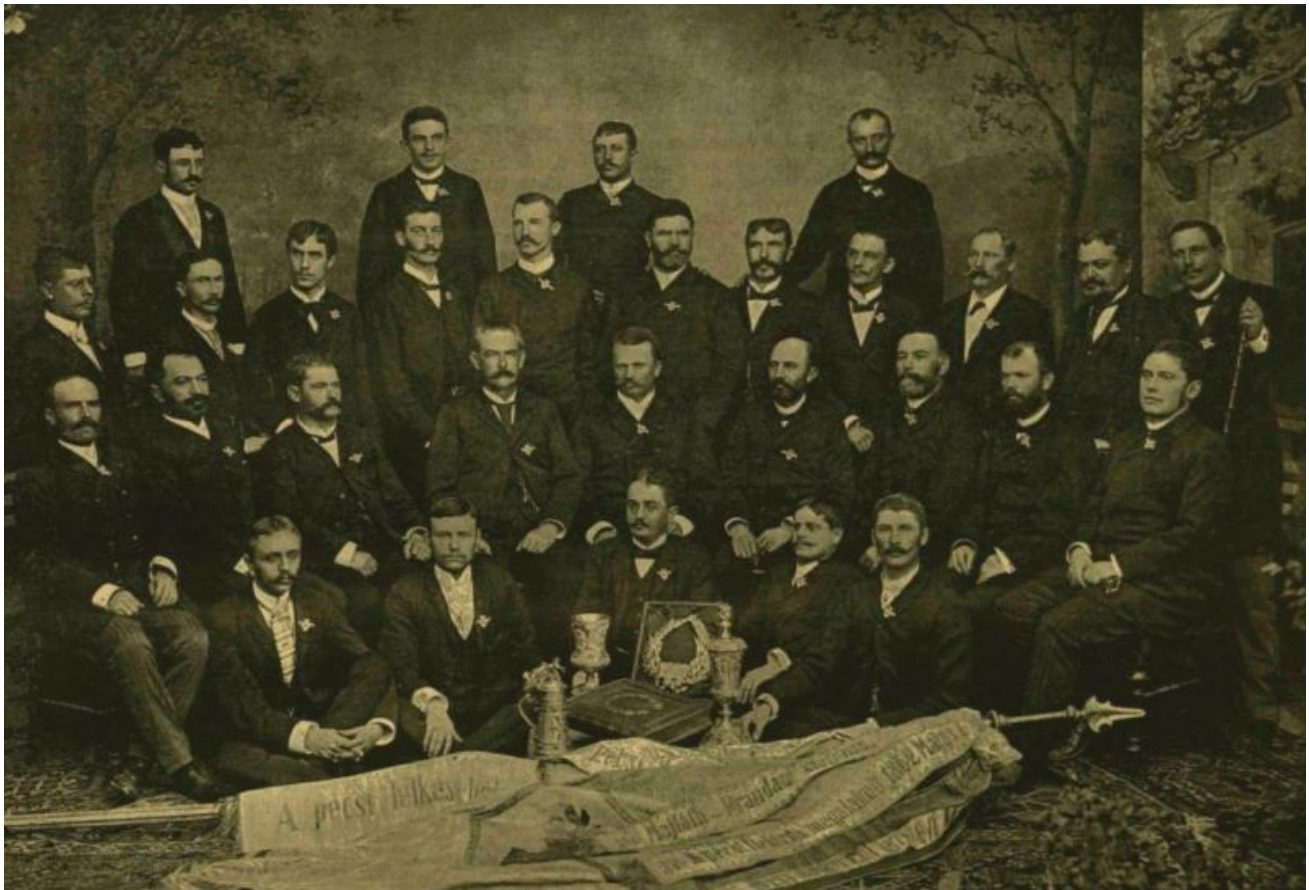
Figure 1: The dalárda in Pécs on the occasion of its thirtieth anniversary, 1891