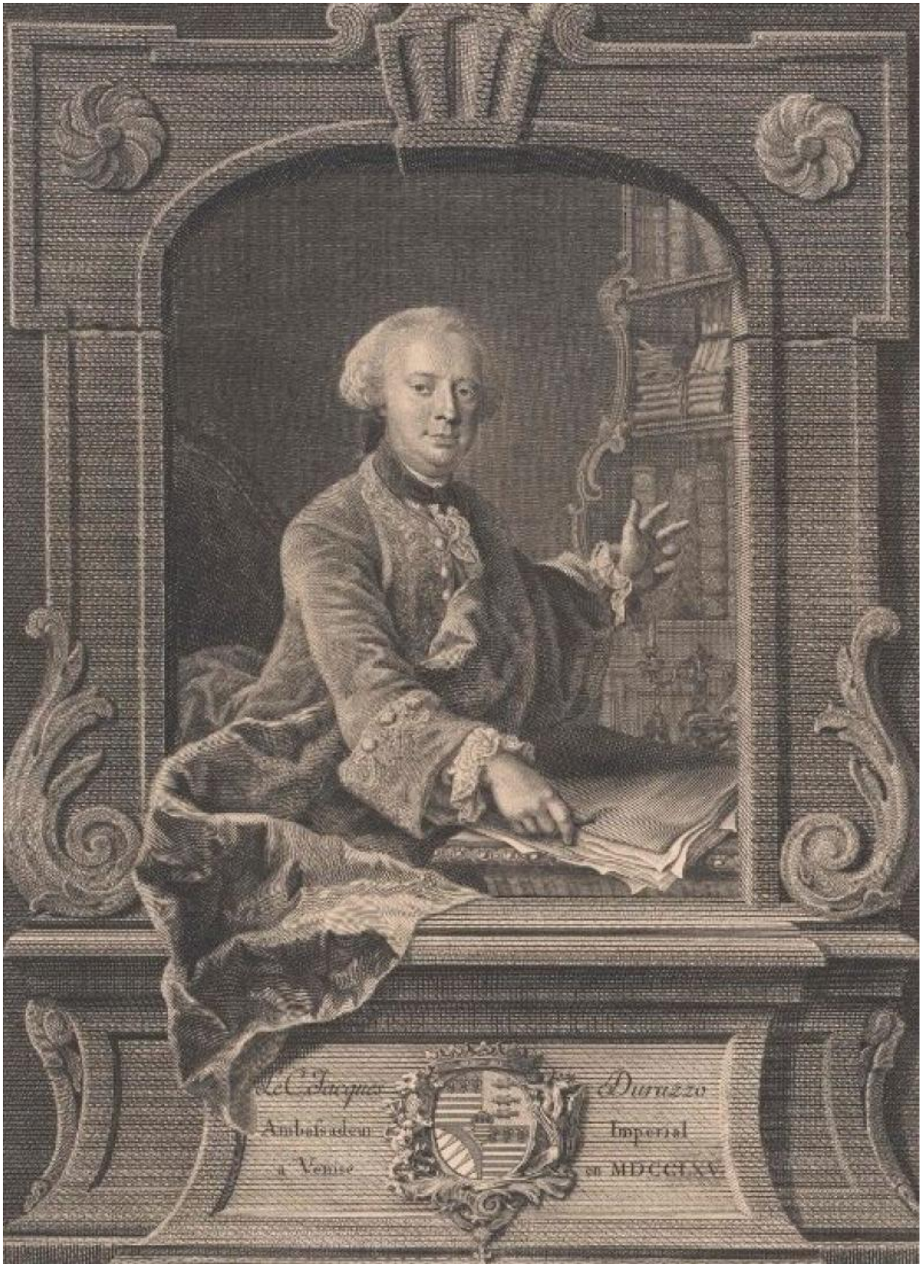
Figure 2: Giacomo Durazzo (1717-94)

As for the old idea of nationalism (or better, cultural chauvinism), there were enough Gottschedians in Vienna who were outraged at the launching of the French troupe at the Burgtheater in 1752. Nedbal cites Benjamin Ephraim Krüger's Vitichab und Denkwart, die