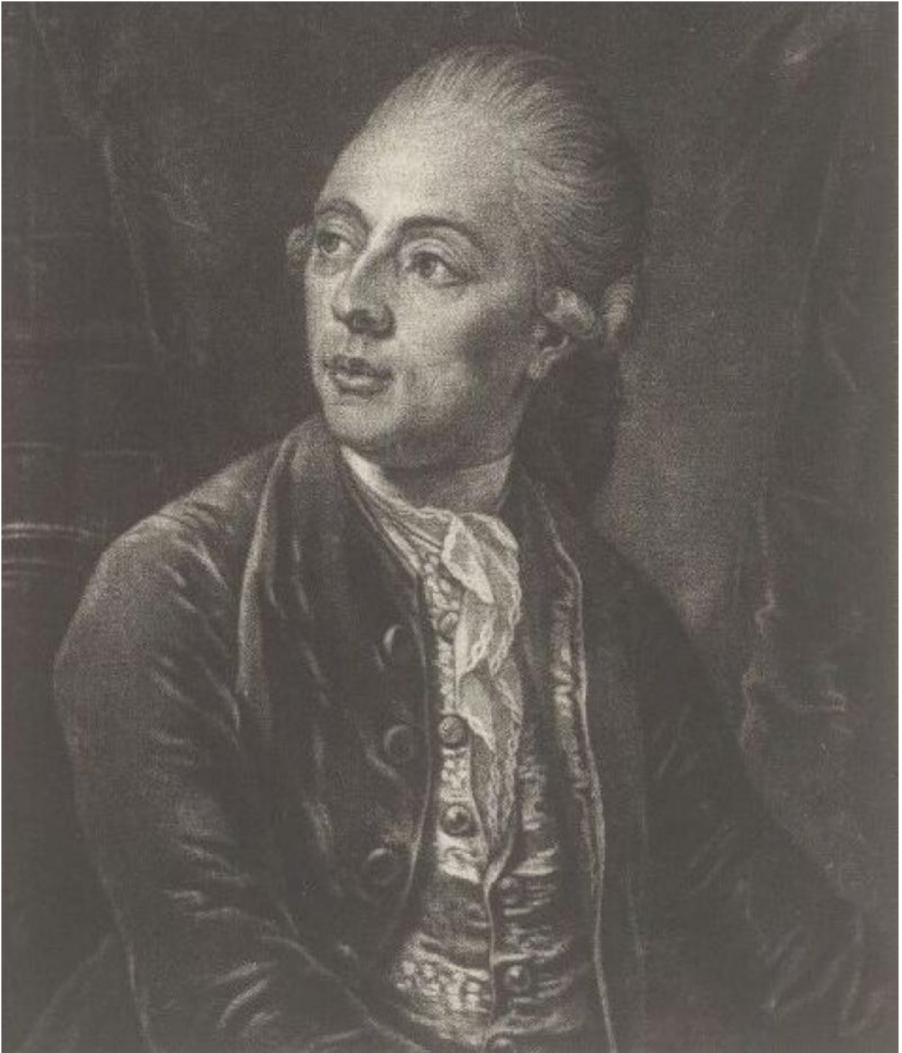
Figure 3: Josef von Sonnenfels (1733-1817)