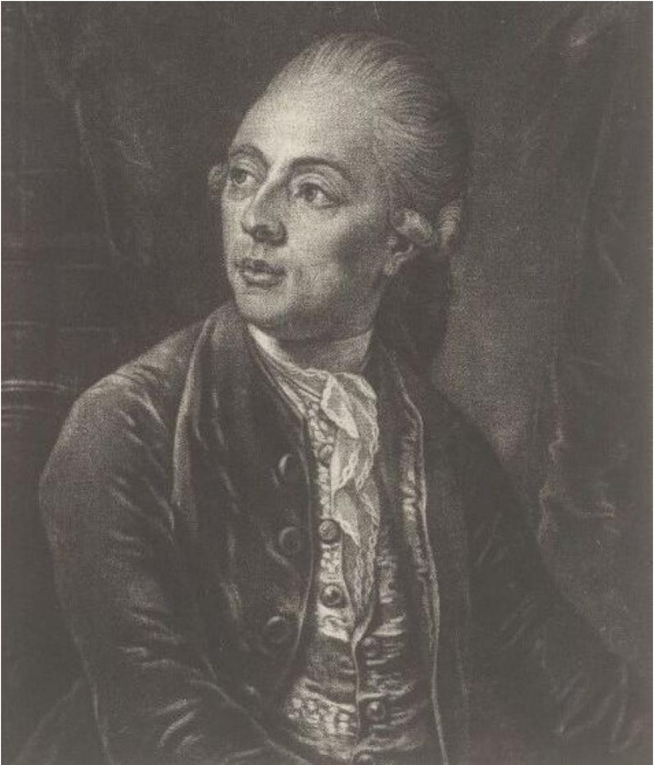
Figure 3: Josef von Sonnenfels (1733-1817)