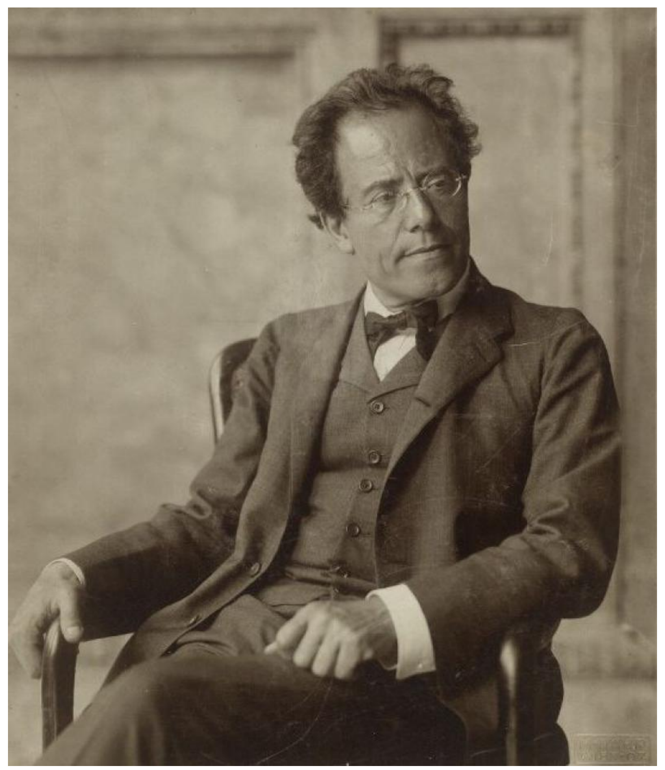
Figure 1: Mahler in the loggia of the Vienna Court Opera