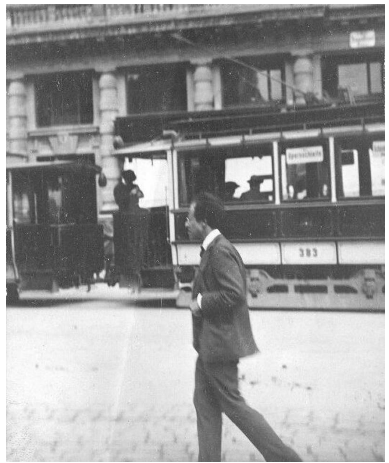
Figure 3: Mahler, after having left through the stage entrance of the Vienna Court Opera (1904); by courtesy of Österreichische Nationalbibliothek, Bildarchiv Austria Using a solid methodology for analyzing primary sources and an extensive international bibliography, Non guardare nei miei Lieder! offers the opportunity to discover Gustav Mahler's musical workshop, exemplified with multiple references to his compositional and performance practice.

I do hope that this book will soon be translated into other languages, since it not only introduces a state-of-the-art methodological approach to Italian musicology, but also represents a major achievement in international Mahler scholarship that deserves to reach a broader audience.