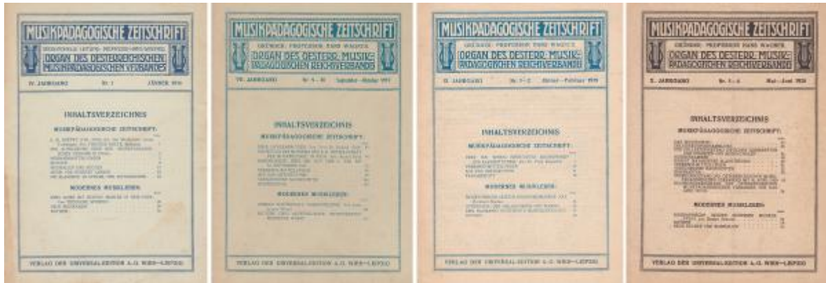
Figure 2: Covers of the Musikpädagogische Zeitschrift

At first glance, the issues of the Musikpädagogische Zeitschrift follow the conventional structure of a music journal, with the additional features of an association newsletter. [20] Integral parts of the journals are essays mainly on music educational topics, which are often printed in installments. The sections already established in the first volume, such as “Verbands-Mitteilungen” (association news), “Bücher und Musikalien” (books and sheet music), and “Notizen” (Notices), were retained. Since the majority of the readership worked in music pedagogical professions, [21] the journal naturally dealt primarily with their everyday work and working conditions. The association fought for a better status for both private and employed music teachers, in terms of their remuneration, their social security, and an upgrading of their training, and was not afraid to name names when pointing out abuses. The sections “Verbands-Mitteilungen” and “Notizen” contain detailed reports of meetings, but also announcements of concerts and other activities of members of the association, in addition to personal information such as professional anniversaries or marriages, reports from the local groups, and job offers. [22] The section “Bücher und Musikalien” presents new publications, with a focus on teaching literature. The end of the editorial section, which is additionally marked with the words “End of editorial section” at the bottom of the page, [23] is followed by a series of advertisements.