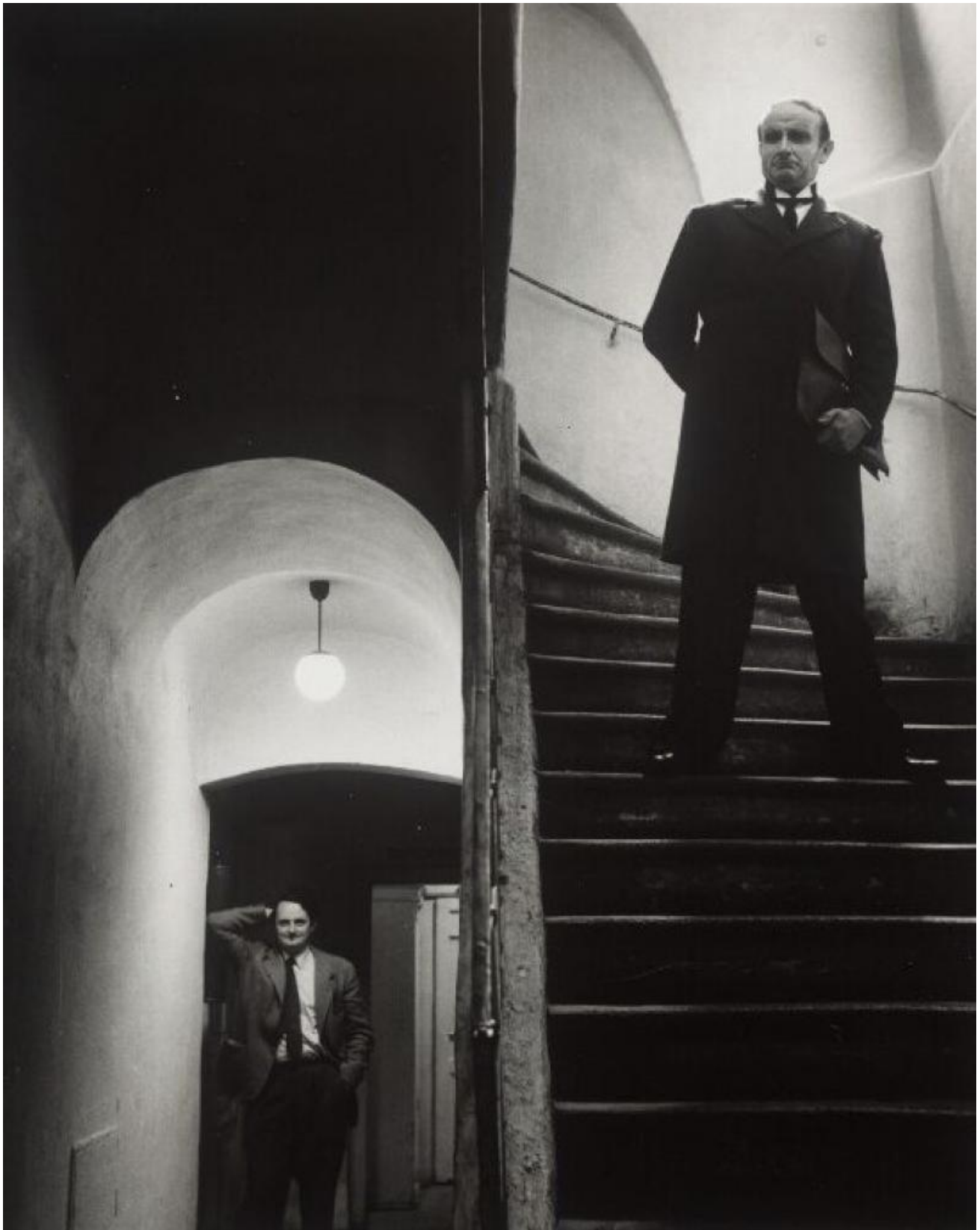
Figure 5: Gottfried von Einem in the context of Der Prozeß Despite extensive searching on my part, I have not found any extant work (by Einem, Brecht, or anyone else) that includes the “prologs” imagined in these three pages. In the six years I have spent studying Einem’s early operas, this is the only document I have discovered that appears to be created ex-nihilo. Generally, Einem draws from existing material rather than creating his own (e.g. Dantons Tod after Büchner’s play, Der Prozeß after Kafka’s novel, Der Zerrissene after Nestroy’s play, Der Besuch der alten Dame after Dürrenmatt’s play, Kabale und Liebe after