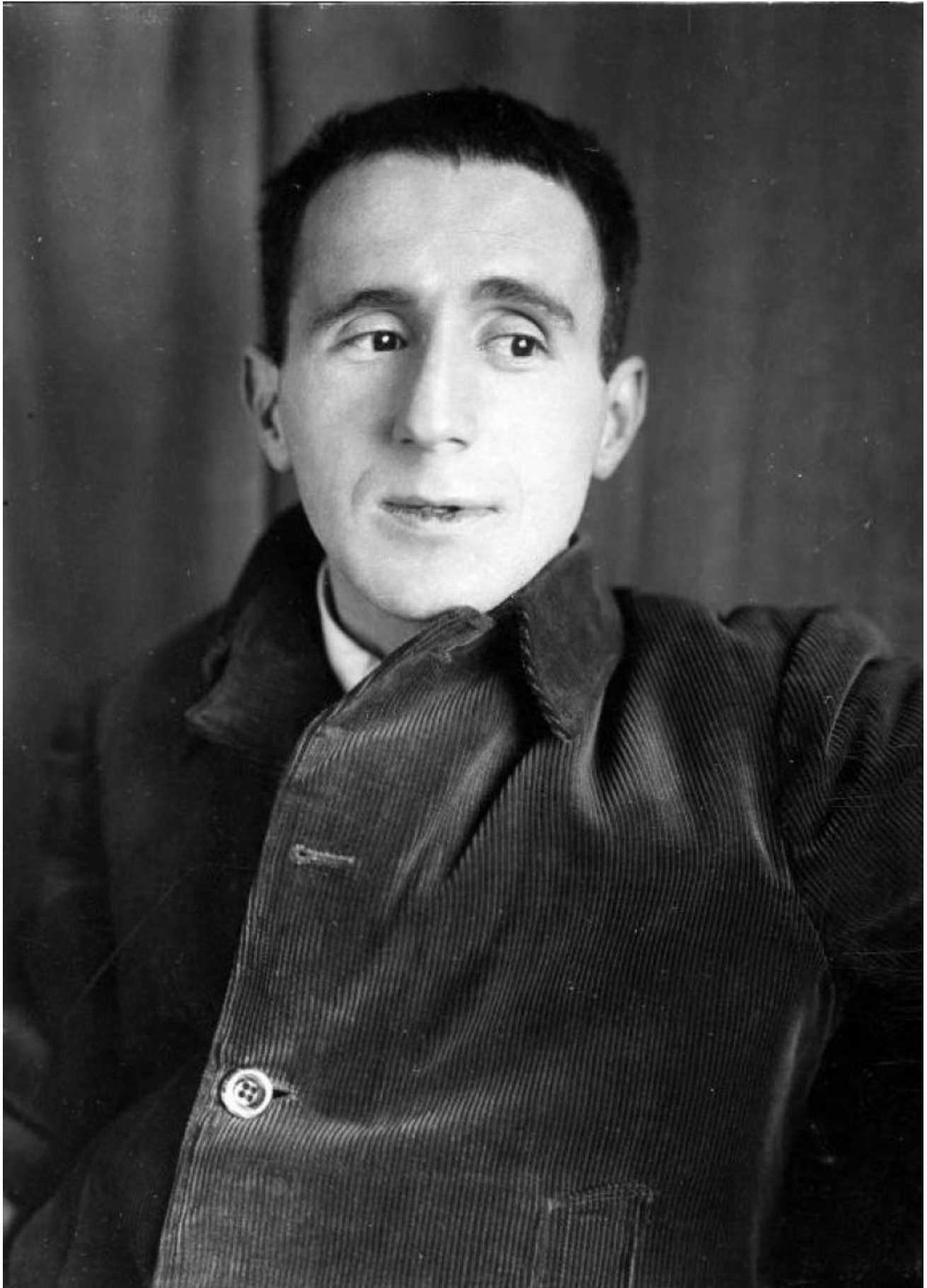
Figure 2: Bertolt Brecht (photograph by Robert Sennecke, before 1940); by courtesy of Österreichische Nationalbibliothek, Bildarchiv Austria

While the story of Brecht's blacklisting in Hollywood, investigation by HUAC on suspicion of his ties to communism, and his subsequent move to East Berlin in 1949 to found the Berliner