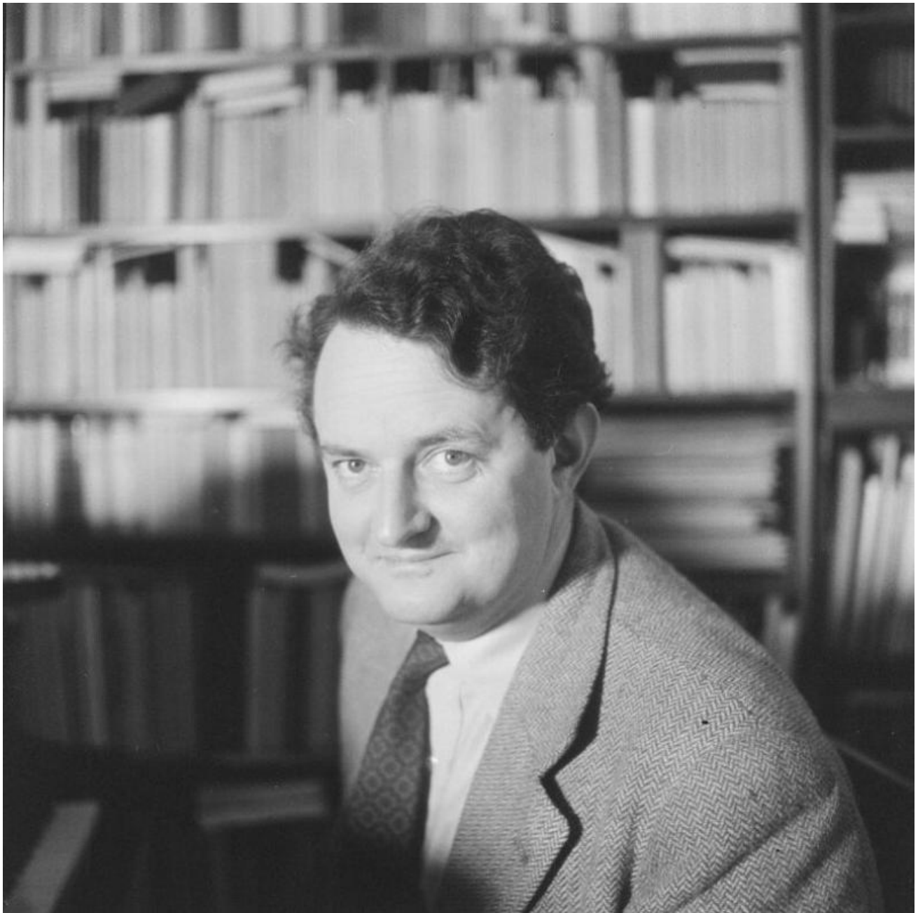
Figure 6: Gottfried von Einem (photograph by Charlotte Till-Borchardt, January 25, 1957); by courtesy of Österreichische Nationalbibliothek, Bildarchiv Austria

The tale of the “Brecht Affair” and the new light shed on Brecht’s engagement with Kafka as reconstructed through documents buried in the Einem archive is but one of the many avenues for interdisciplinary research this collection offers. Enticing insights into operatic adaptation of literary texts writ large, as well as the attitudes of specific authors, including those of Dürrenmatt and Lotte Ingrisch (1930–2022), the Austrian author and librettist who became Einem’s second wife, towards the modification (or perhaps, mutilation) of their works, and undiscovered literary criticism by theorists such as Brecht lie in wait for any scholar able to approach Einem’s archive from perspectives other than the musicological. Indeed, the example of Einem’s archive proffers the tantalizing possibility that there is much to be unearthed in other archives by the critically interdisciplinary eye.