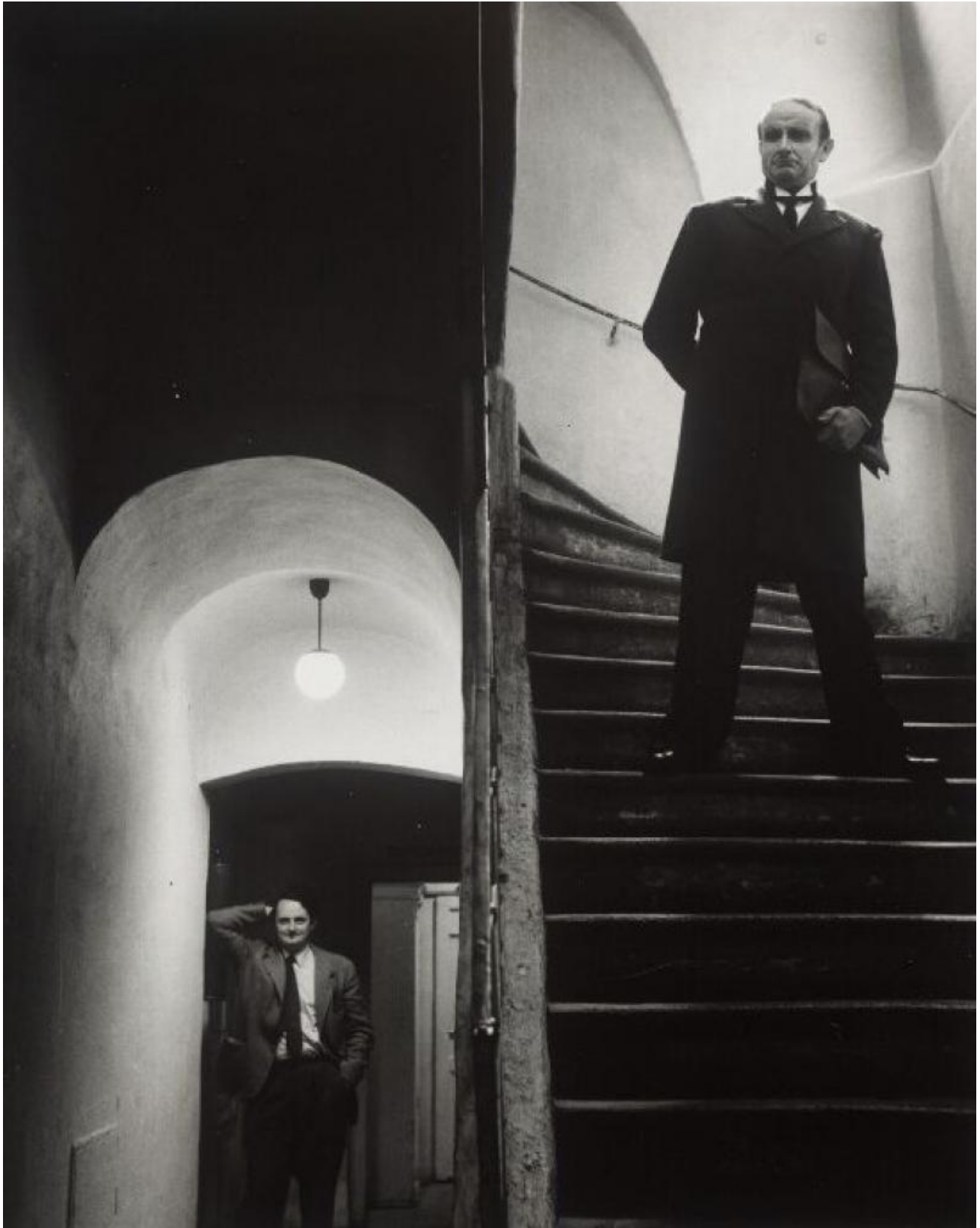
Figure 5: Gottfried von Einem in the context of Der Prozeß ; Despite extensive searching on my part, I have not found any extant work (by Einem, Brecht, or anyone else) that includes the “prologs” imagined in these three pages. In the six years I have spent studying Einem’s early operas, this is the only document I have discovered that appears to be created ex-nihilo. Generally, Einem draws from existing material rather than creating his own (e.g. Dantons Tod after Büchner’s play, Der Prozeß after Kafka’s novel, Der Zerrissene after Nestroy’s play, Der Besuch der alten Dame after Dürrenmatt’s play, Kabale und Liebe after