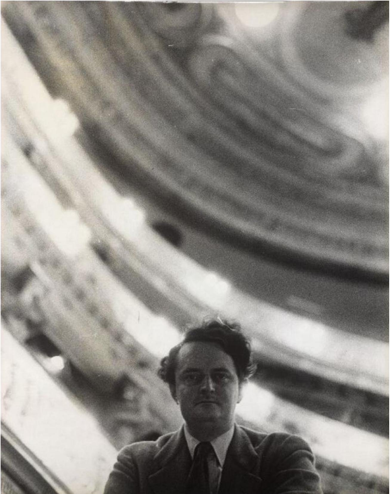
Figure 1: Gottfried von Einem in the Vienna State Opera In 1941, Einem began formal composition lessons with Boris Blacher, producing the ballet Prinzessin Turandot , op. 1, and the Capriccio for Orchestra , op. 2, both receiving critical acclaim at their premieres in 1944 at the Dresden State Opera and 1943 in Berlin, respectively. In fact, the success of Einem's Capriccio prompted Karajan to commission another work, which became Einem's Concerto for Orchestra , op. 4. The jazz influences of this work drew condemnation from the press, bringing both Einem and his Concerto to the attention of Propaganda Minister Josef