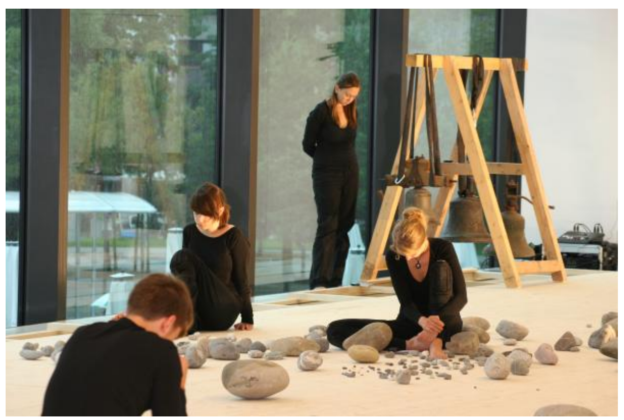
Figure 5: Georg Nussbaumer, LAWINE, WALD UND STUBENMUSI , Bregenz 2009

Nussbaumer's concert installation LAWINE , WALD UND STUBENMUSI (Avalanche, forest, and "living room music") for river stones, bells, branches, and solar-powered string instruments, presented at the Bregenz Festival in 2009 in the program section "Kunst aus der Zeit."<sup>[50]</sup>