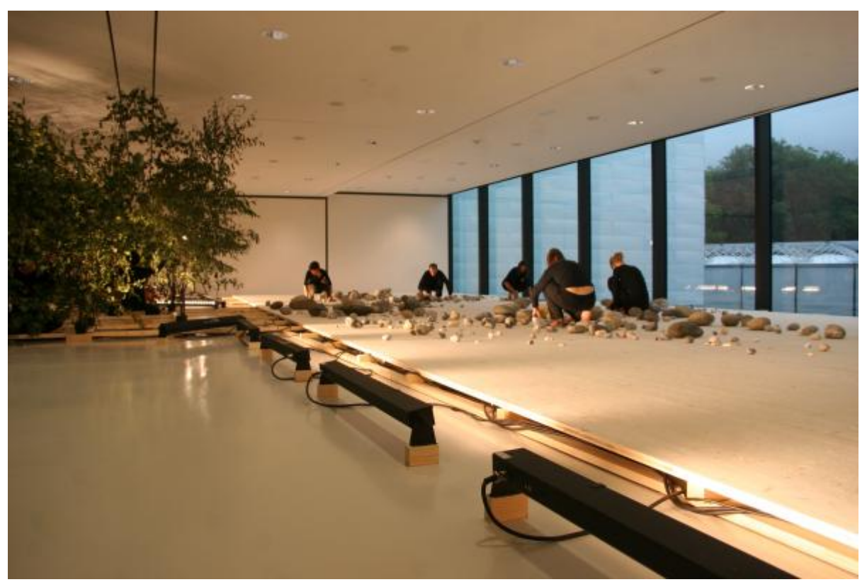
Figure 6: Georg Nussbaumer, LAWINE, WALD UND STUBENMUSI , Bregenz 2009; photo credit: Madlene Therese Feyrer

It should be noted that in many sound installations objects, strings, or room elements such as pipes or glass plates are set in motion by vibrational agents, but usually with inconspicuous or hidden devices such as body sound converters or "bodyshakers." Nussbaumer's vibrators, on the other hand, are not only visible but combine the cozy world of "Stubenmusi" with the "normality" of obscene erotic fantasies, sexuality, masochism, sadism, exhibitionism, and violence, which are lived out in the "Stube" (living room or parlor), in the bedroom, or in Austrian basements. [52] Nussbaumer has already worked with such vibrators in other contexts, for example in his installation opera orpheusarchipel (Bielefeld 2002) or in the piano piece Junggesellenflügel (2006), in which the vibrators protrude from the inside of the grand piano. Sabine Sanio emphasized the connection of Nussbaumer's vibrators with the Orpheus myth: