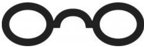
Figure 8: Look at the one who has prescribed the sign at the same time, Otto M. Zykan, Inscene 2. Instructions (Unpublished score, 1967), 1.

Zykan subsumed works in which pitch organization, text, and choreography are interlinked under his own neologism “peripathesis” ( Peripathese ). [41] He developed the compositional method of “peripathesis” through his preoccupation with serialism. As he felt that serialism was insufficient for his compositional intentions, he expanded it to include two aspects: On the one hand, language is also organized musically, and on the other hand, the strictness and consistency of the organization of language and music gives rise to theatricality. [42]