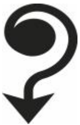
Figure 5: Singer stands facing away from the audience, Otto M. Zykan, Inscene 2. Instructions (Unpublished score, 1967), 3.