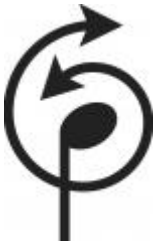
Figure 3: 360 degree rotation, Otto M. Zykan, Inscene 2. Instructions (Unpublished score, 1967), 3.

which results in a paradoxical “tension and interplay of structure and anti-structure” (“Mit- und Gegeneinander von Struktur und Antistruktur”). [37] “The entire course of the setting is based on a seven-part interval series,” [38] which in itself is nothing special. Zykan, however, deliberately composed errors. Every error in the series—that is, an out-of-order or unnecessary sound—is visualized through the instruction to perform an action, such as taking a step or looking at the “culprit” (“Schuldigen”). [39] Certain errors require specific actions, for each of which Zykan invented its own special characters: [40]