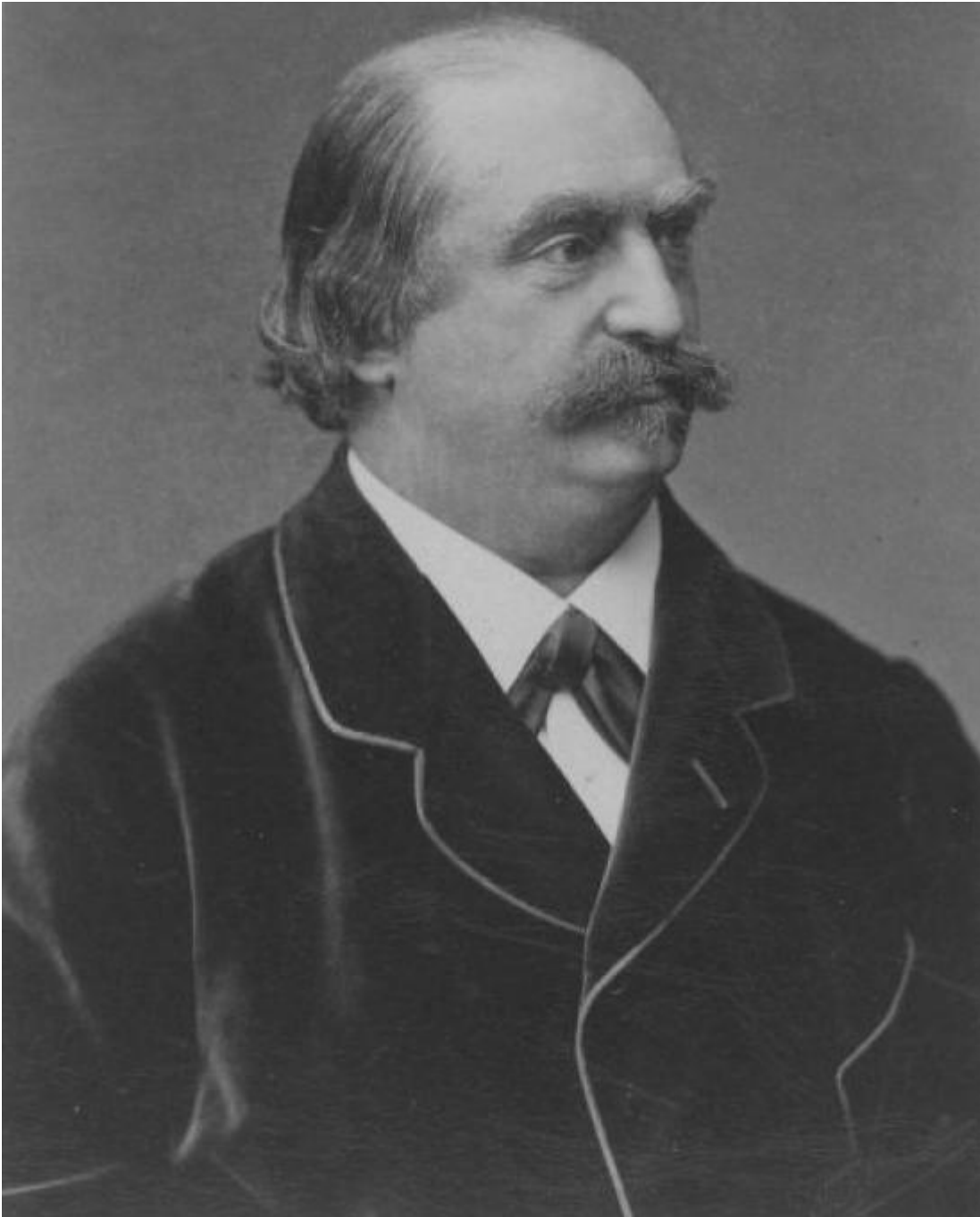
Figure 5: Eduard Hanslick (1825-1904)