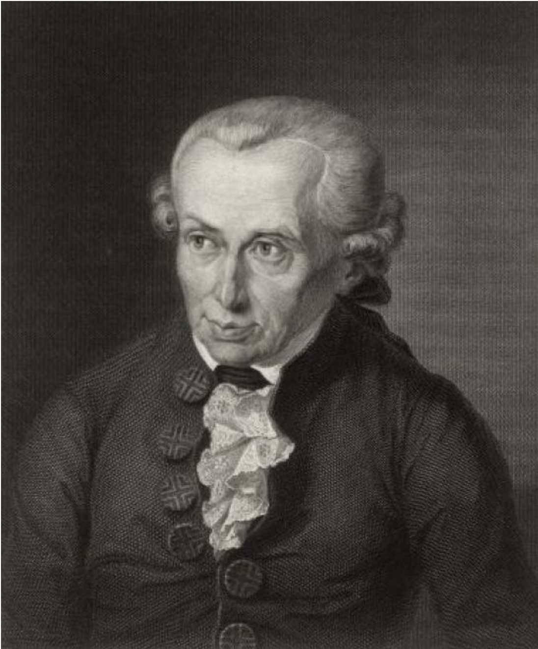
Figure 4: Immanuel Kant (1724-1804)

By courtesy of Österreichische Nationalbibliothek, Bildarchiv Austria