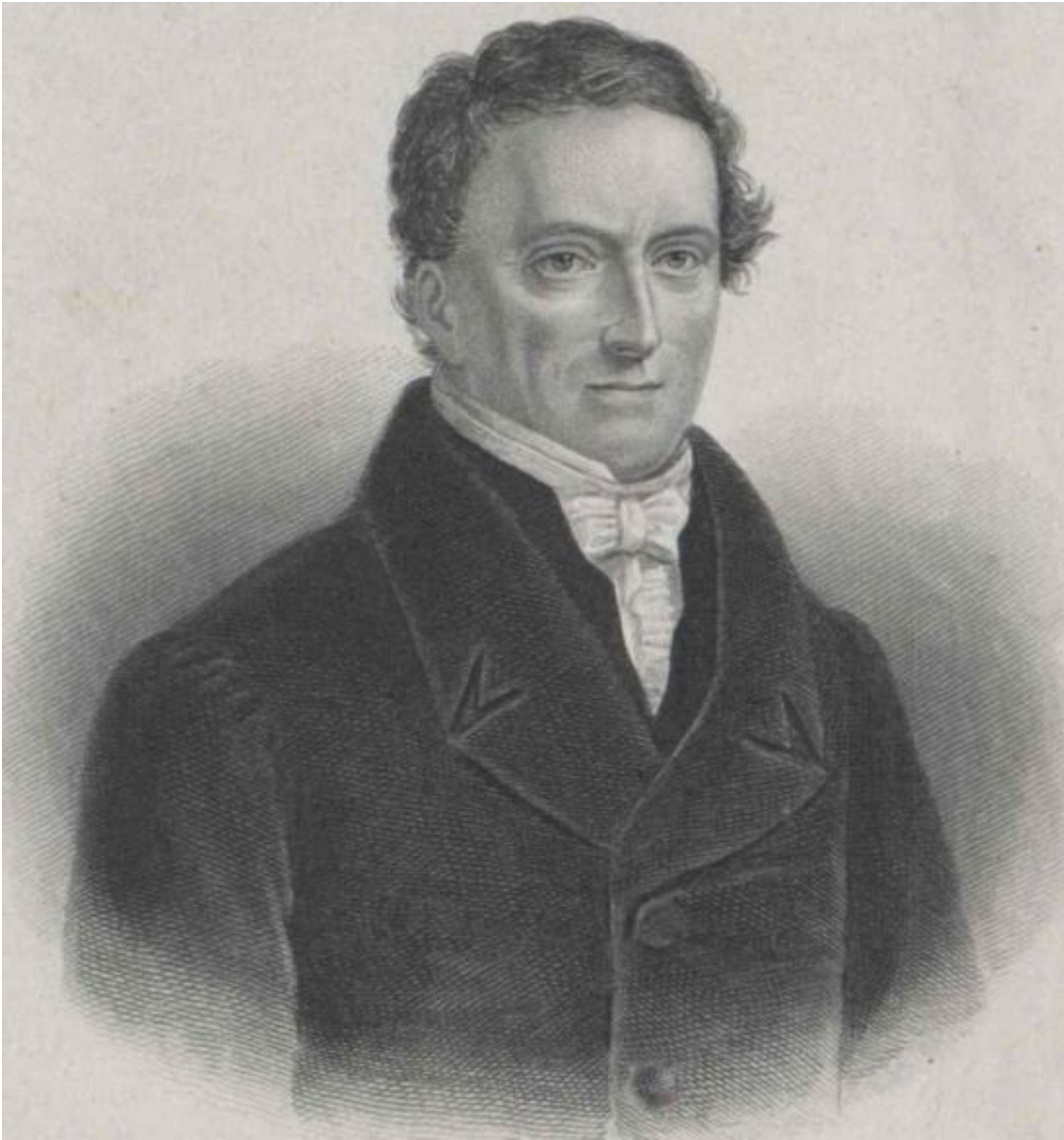
Figure 2: Johann Friedrich Herbart (1776-1841)