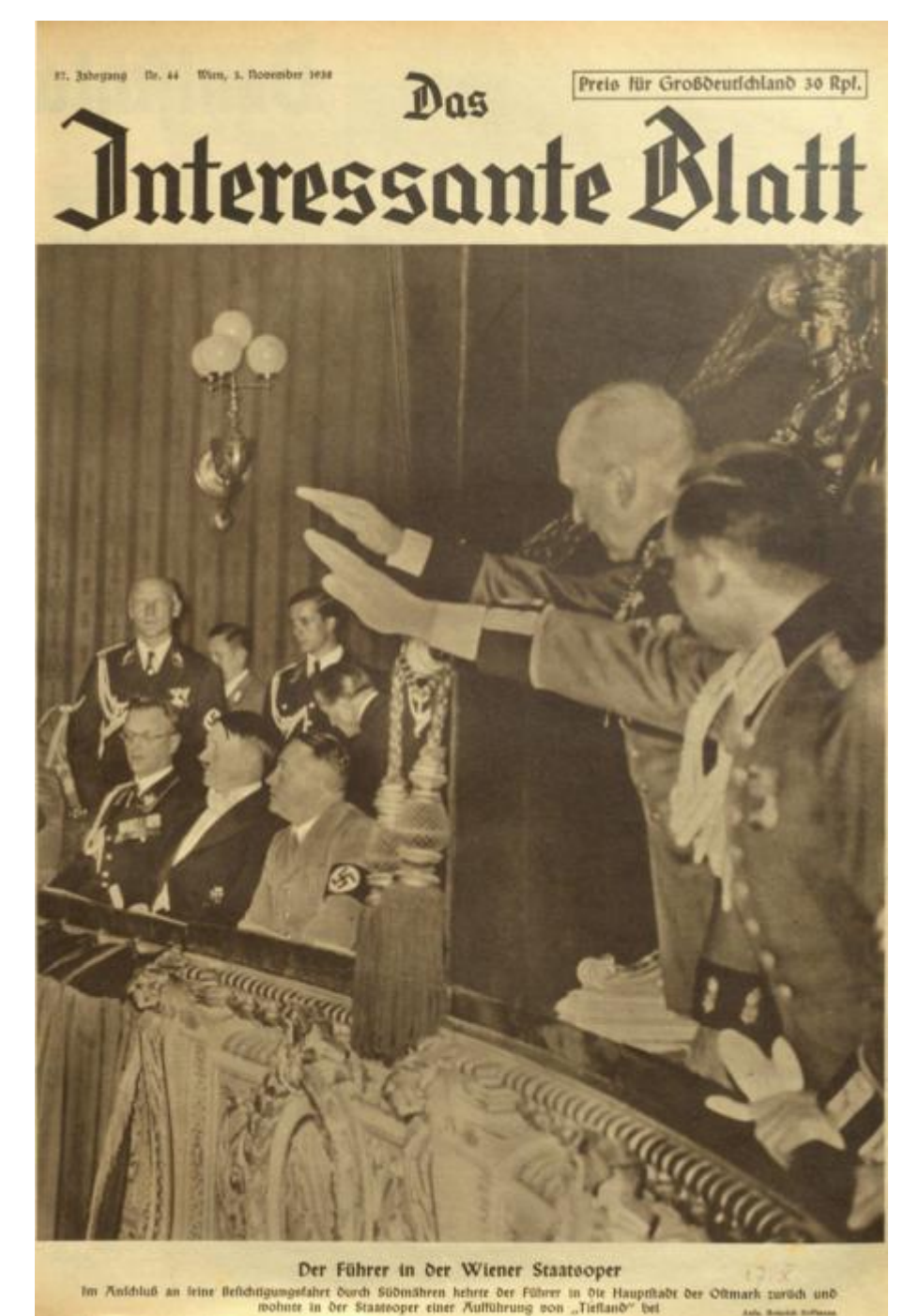
Figure 1: Der Führer in der Wiener Staatsoper Das Interessante Blatt, November 3, 1938

value of this list, however, is limited due to the omission of repeated performances whose cast was only slightly different. Another example is the record of the guests at the Opera Ball on January 15. Here, Stoy provides two pages with the names of a total of 82 persons, including their titles and the people accompanying them, but he does not provide any analysis that might have given this long list of names some sort of systematic order (84–85). For valuable information such as this, an editorial approach might have been more appropriate. In its execution, the book seems less a systematic analysis based on guiding questions, but more like an encyclopedia.