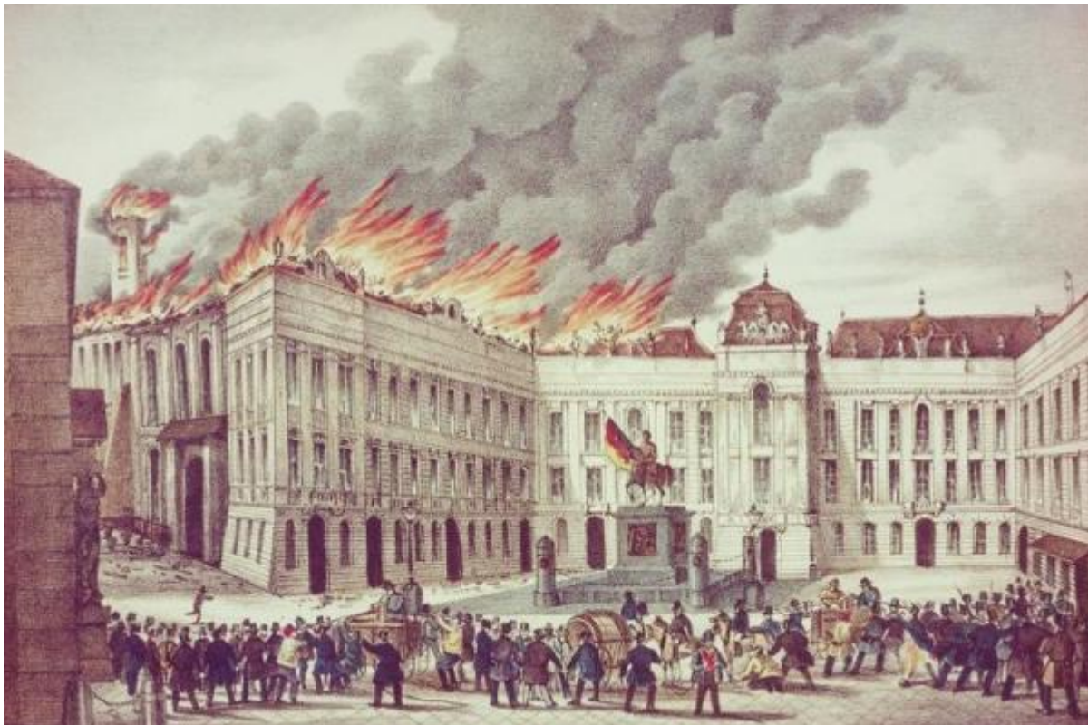
Figure 2: Wiener Oktoberaufstand 1848, Dachbrand der Hofbibliothek und der Augustinerkirche am Josefsplatz, Kolorierte Lithografie, 1848