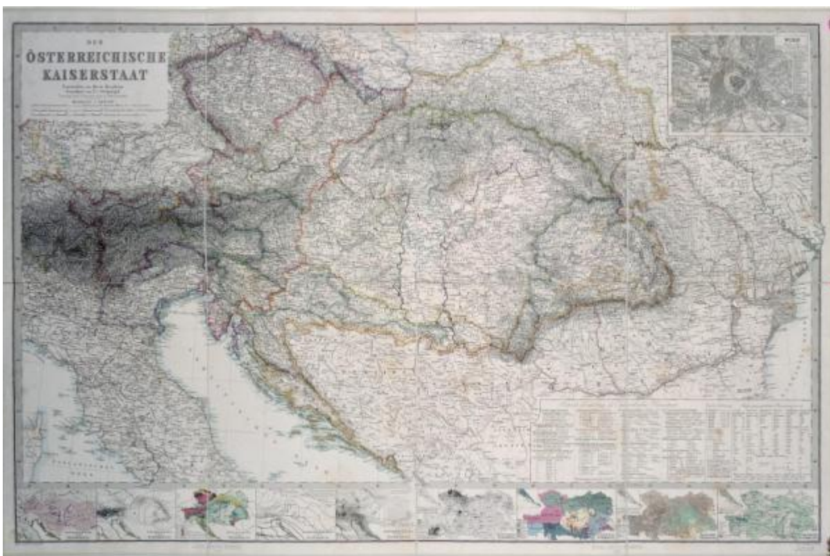
Figure 3: Der Österreichische Kaiserstaat