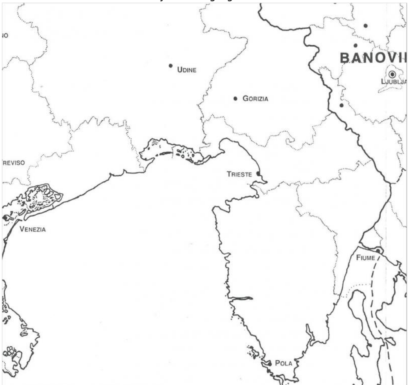
Figure 5: Eastern boarder of Italy, 1924-41, published in Il confine mobile: Atlante