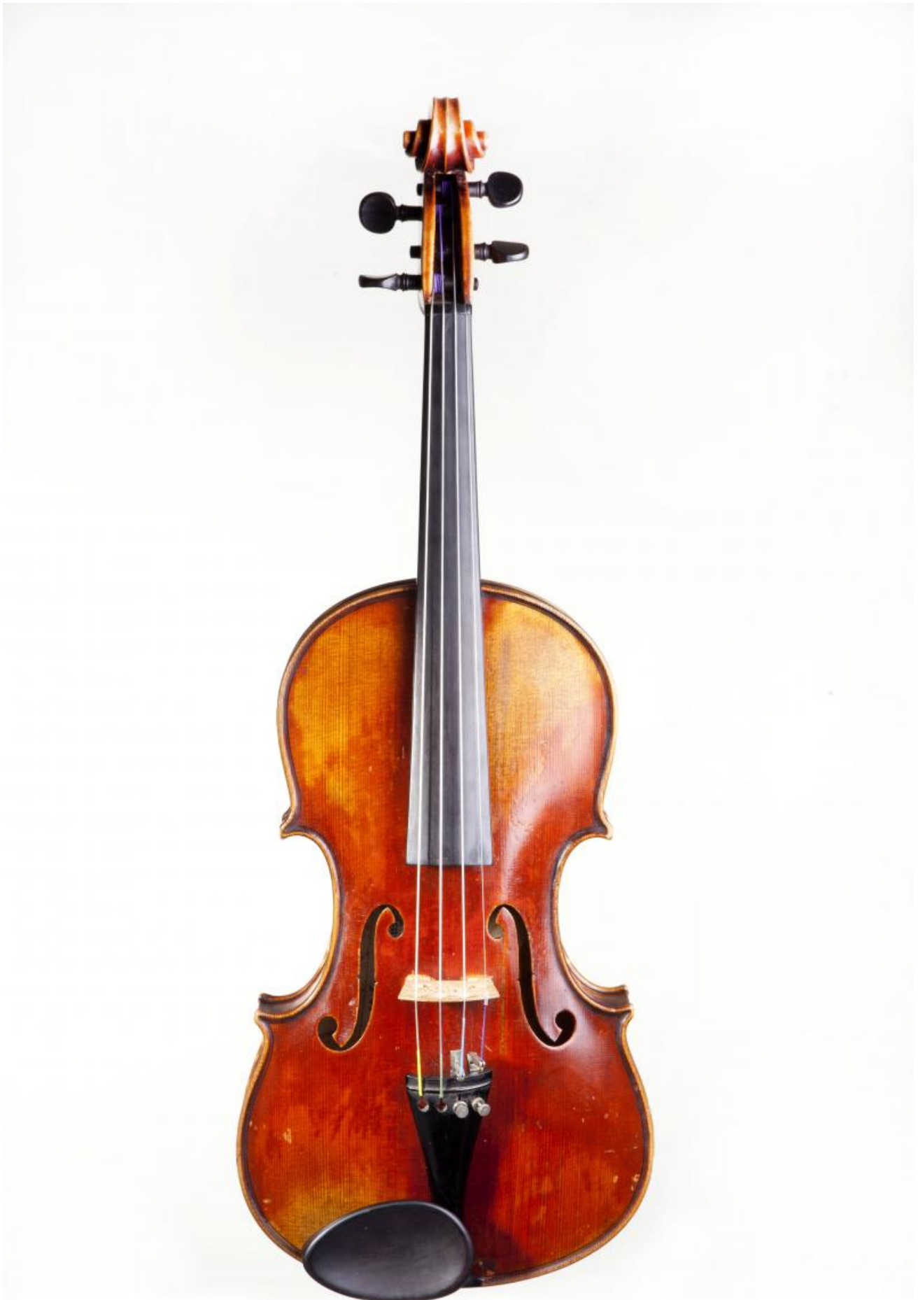
Figure 8: Violin built by Kresnik in 1910, front view (unidentified photographer); by