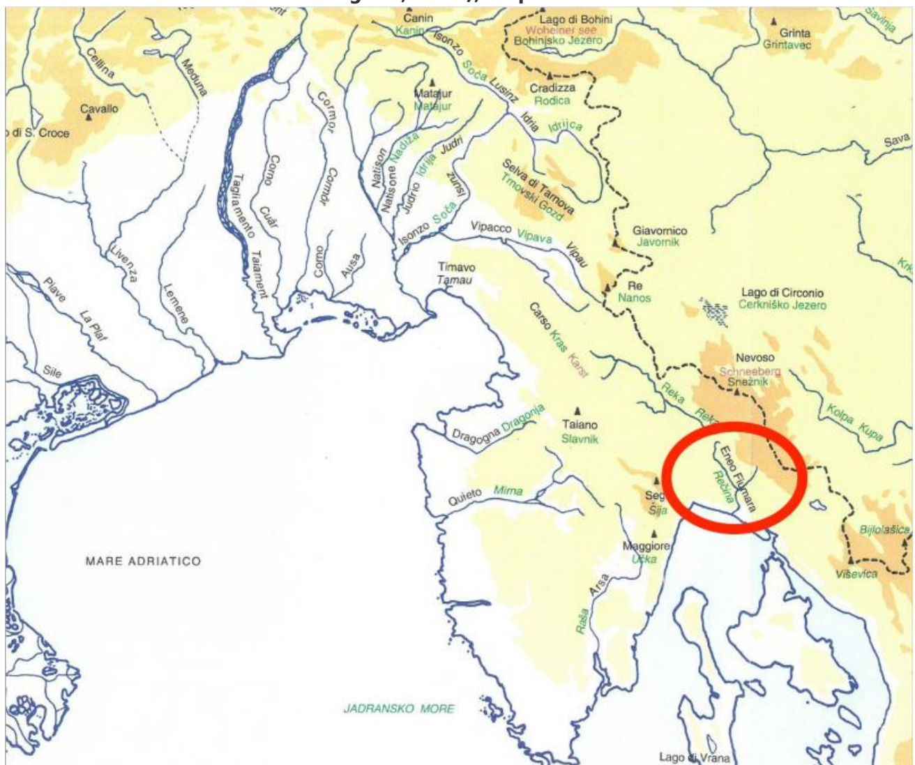
Figure 6: Physical map of the upper Adriatic; the river Eneo / Fiumara / Rečina is highlighted, published in Biondi, Il confine mobile , Map nr. 1.

storico dell'Alto Adriatico 1866-1992, ed. Neva Biondi, Istituto Regionale per la Storia del Movimento di Liberazione nel Friuli-Venezia Giulia (Monfalcone: Edizioni della Laguna, 1996), Map nr. 9.