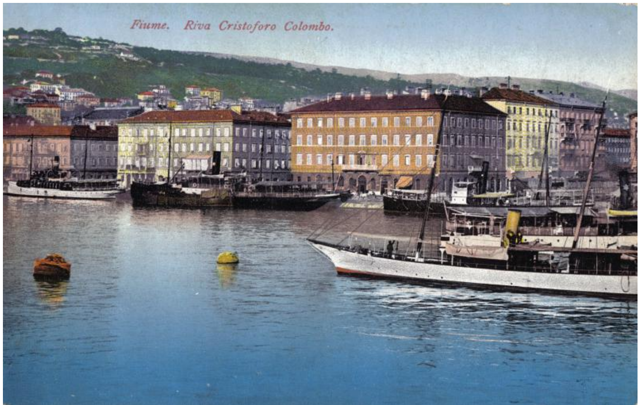
Figure 3: Riva Cristoforo Colombo, Fiume; Kresnik's medical practice was located at number 8; by courtesy of the Maritime and History Museum of the Croatian Littoral