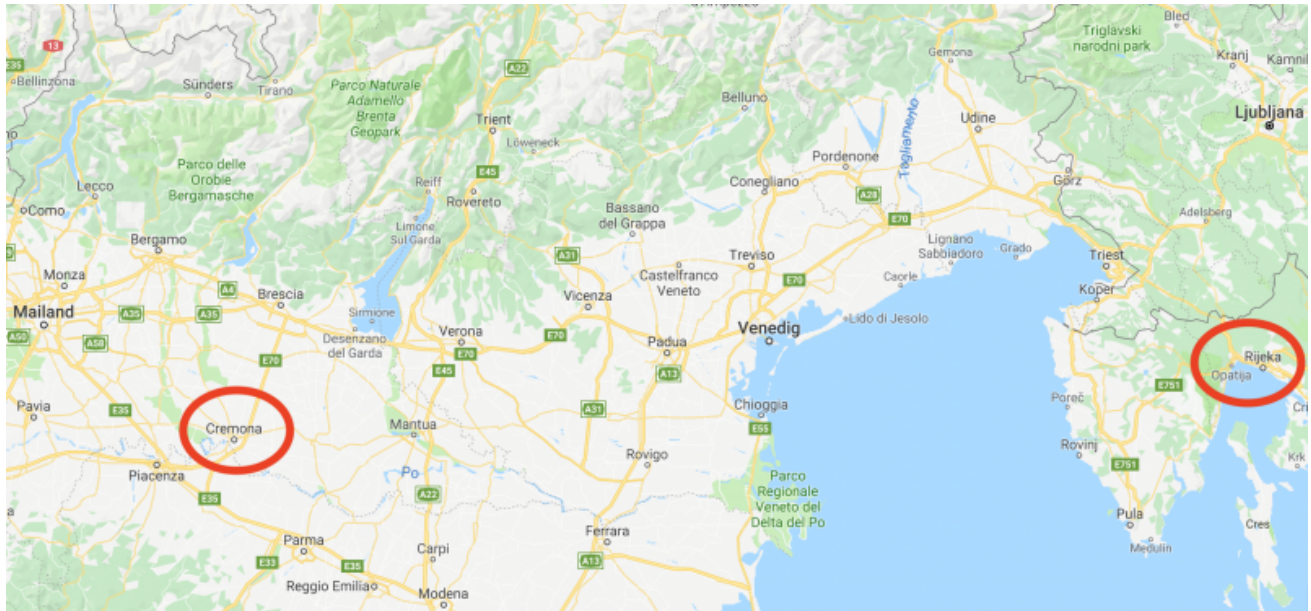
Figure 4: Northern Italy, Slovenia, and Croatia today (Google Maps); Cremona and Rijeka are highlighted.