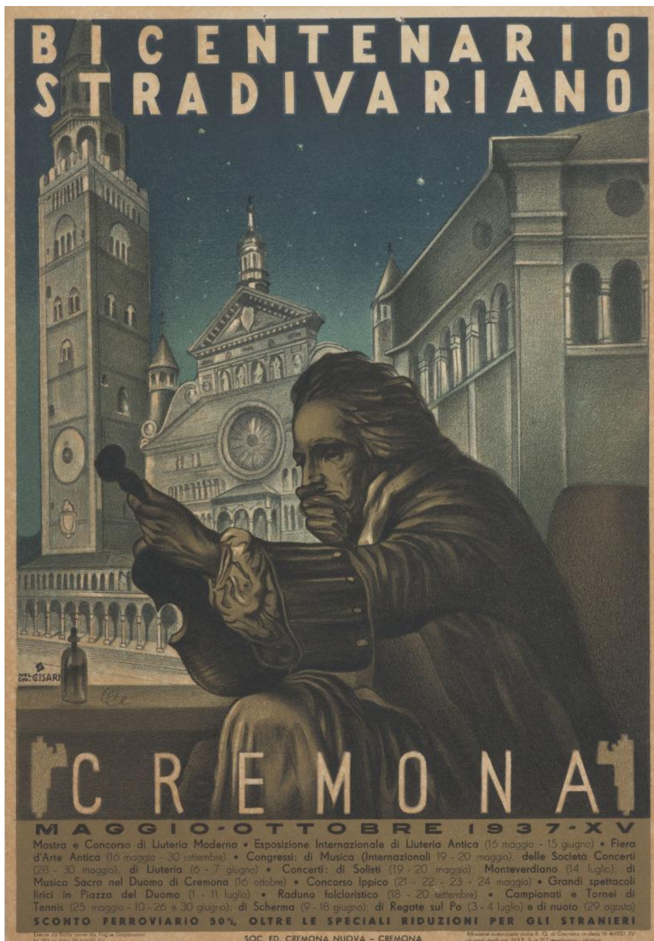
Figure 2: Cisari Giulio, Poster for the Bicentenario stradivariano (1937), Treviso,