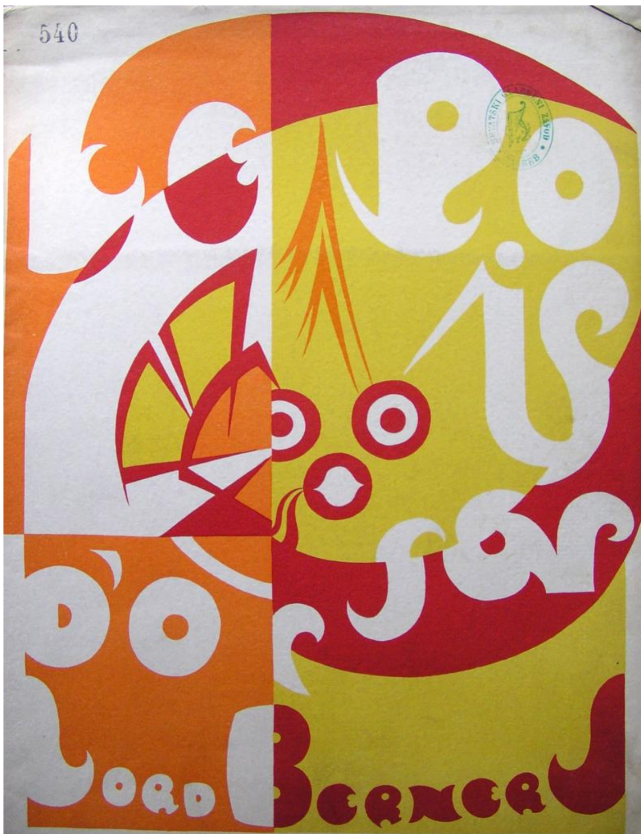
Figure 4: cover of Le poisson d'or by Lord Berners, illustrated by Natal'ya Gončarova, 1919