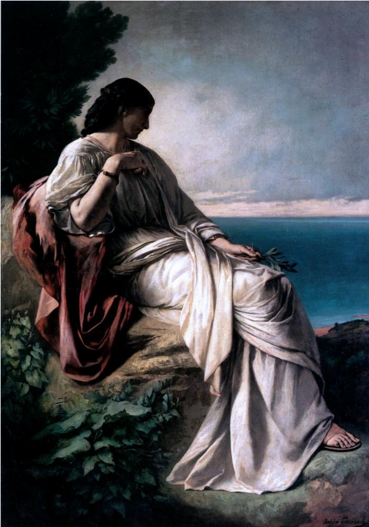
Figure 4: Anselm Feuerbach, Iphigenie (1862)

In dealing with the Gesang der Parzen , Grimes turns on its head the procedure she adopted for the Schicksalslied . There, critics were taken to task for failing to consider the broader context—that is to say, Hölderlin's novel. Here, Grimes argues that a satisfactory interpretation can be reached only by laying to one side Goethe's play. At first glance, the change of approach