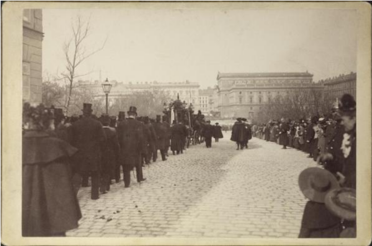
Figure 5: Johannes Brahms's cortege from Karlsgasse to Lothringerstraße (June 6, 1897); by courtesy of Österreichische Nationalbibliothek, Bildarchiv Austria

[6] In “Beethoven’s Ninth Symphony: The Sense of an Ending” Maynard Solomon argued that Beethoven’s capacity for endless metamorphosis—just as much a feature of Brahms’s compositional process, of course, as of Beethoven’s—“runs the danger of yielding to the chaotic; it defeats form, and makes endings improbable, for it will not accept any ultimate resting-place, or any implication of finality.” [25] There’s more than a hint of this phenomenon in several of the works considered here, not least the Vier ernste Gesänge . Brahms’s spirals—or circles—repeatedly invoke the idea of unfinished business. After all, the completion of one rotation, to hijack James Webster’s term, does not preclude the possibility of further travel.