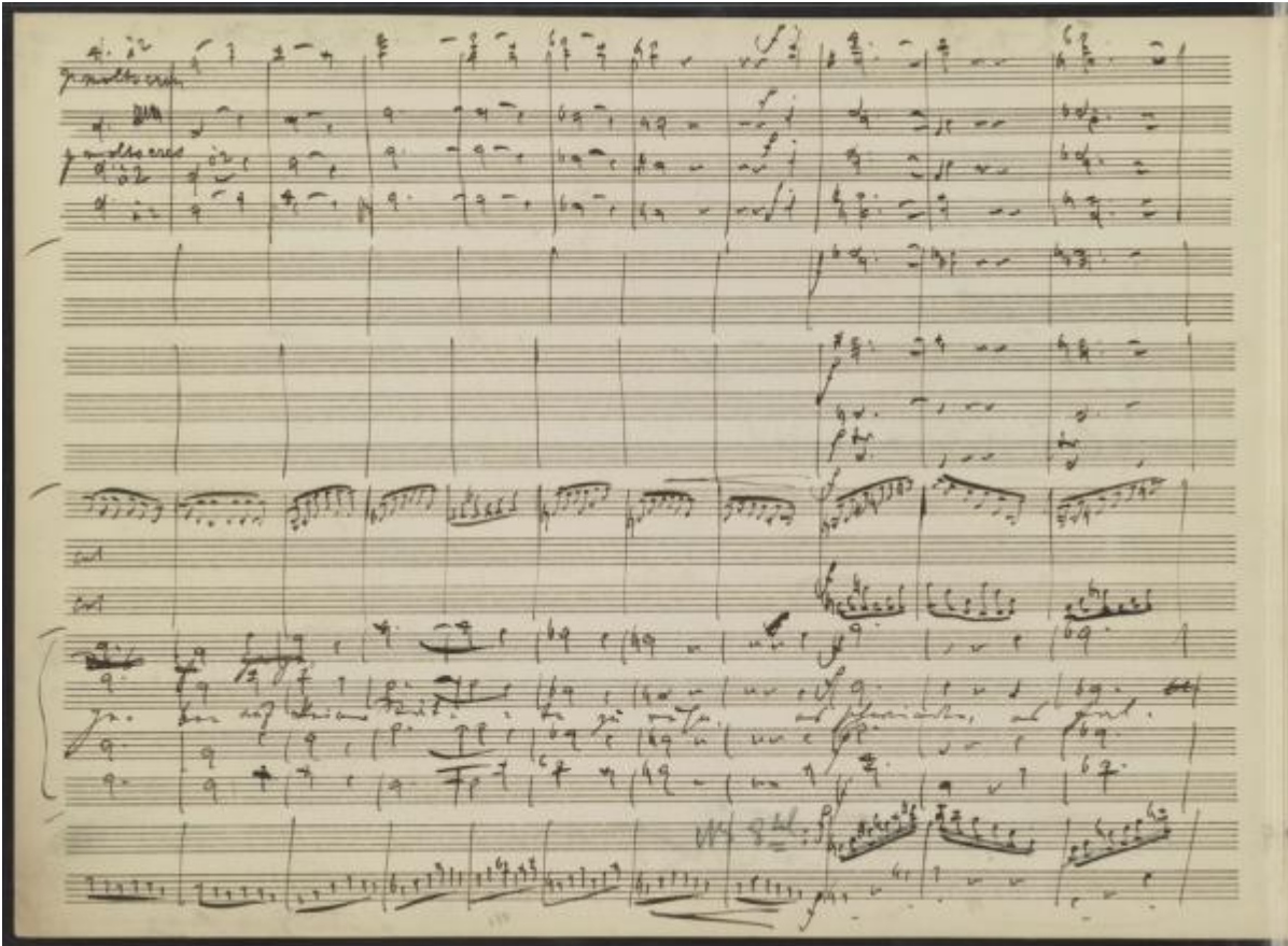
Figure 2: Johannes Brahms, Schicksalslied (Op. 54, 1871), autograph (p. 26)

Most interpretations of the Schicksalslied are strongly colored by the available documentary evidence. In this case, we possess unusually rich material about Brahms's compositional process. Correspondence with Hermann Levi and Carl Reintaler reveals a composer uncertain how to respond to the grim outcome of Hölderlin's poem. The poet contrasts the beatific existence of the gods, bathed in heavenly breezes, with the travails of humankind, whose lot on earth affords no certainties. [15] Hölderlin ends in despair with a description of mortals plunging from cliffs into unmeasured depths. [16] Faced with this deeply pessimistic image, Brahms decided ultimately to translate the two sections of Hölderlin's poem into a piece of music in ABA' form where the A' section, as we have seen, is a transfigured, textless version of the opening. [17] Inevitably, perhaps, the composer's uncertainty over how to respond to Hölderlin's denouement has dominated hermeneutic approaches ever since. One can't help wondering whether the reception of the Schicksalslied would have been rather different—more Schumann-centered?—if history had failed to provide this unusually helpful biographical perspective.