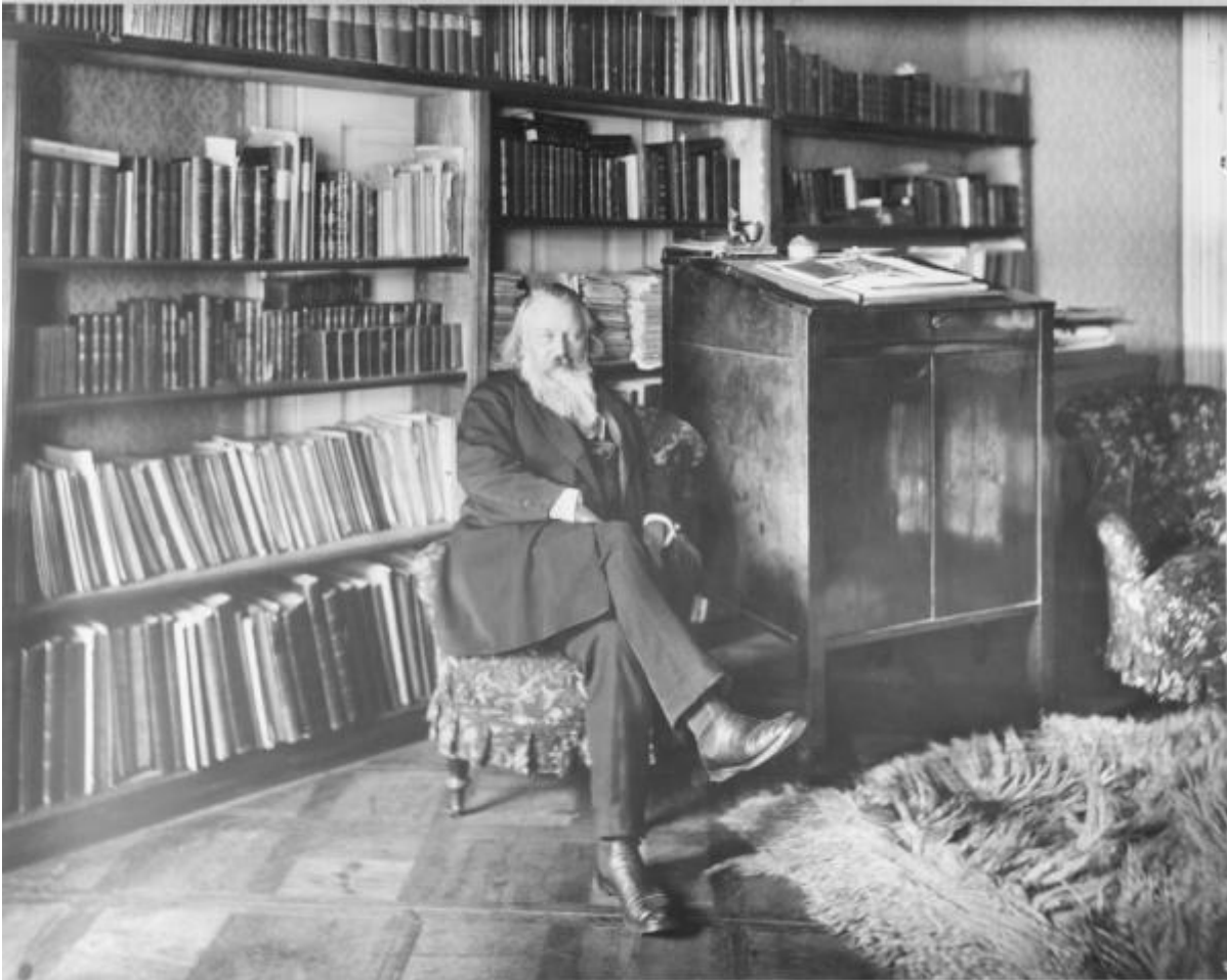
Figure 1: Johannes Brahms in his study in Vienna

Endings have long preoccupied musicians. Indeed, Adorno was particularly drawn to the way in which Brahms finished his finales—the endings of his endings, so to speak—claiming that they are imbued with “splendid resignation” (15). But it’s not just pioneering critics who have obsessed over endings: every student of nineteenth-century music is likely to be exposed at one point or another to the so-called finale problem. [2] This is usually traced to the gauntlet thrown down by Beethoven in his Ninth Symphony. However, some such as Maynard Solomon in “Beethoven’s Ninth Symphony: The Sense of an Ending” have brought other works—in this case, the “Hammerklavier” Sonata, Op. 106, and the B flat major String Quartet, Op. 130—into the equation. [3]