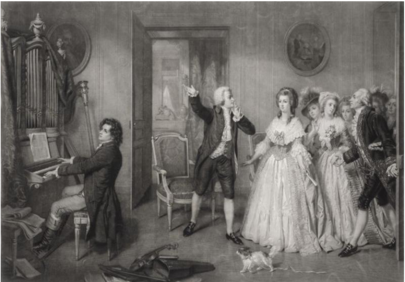
Figure 2: Ludwig van Beethoven chez Wolfgang Amadeus Mozart (etching by Prosper-Pail-Ernest Allais after a painting by Gugues Merle)

nineteenth-century group engraving of Mozart, Haydn, and Beethoven, a colored image of the old university, an imaginary scene or Fantasieszene that shows Beethoven playing what looks like a domestic organ with Mozart urging a group of onlookers to pay attention to the master, the title page of Abbé Stadler's celebrated defence of the authenticity of Mozart's Requiem (an outlook that Beethoven strongly supported), and an engraving of Gottfried van Swieten. Compared with primary sources such as sketchbooks, autograph scores, authentic editions, letters, and conversation books, visual material of this kind has not figured significantly in Beethoven scholarship, partly because the primary documentary base is so comprehensive and informative, partly for the very practical reason that it is more difficult to access and certainly costly to reproduce. In a fundamental sense the Vienna volume is eye opening.